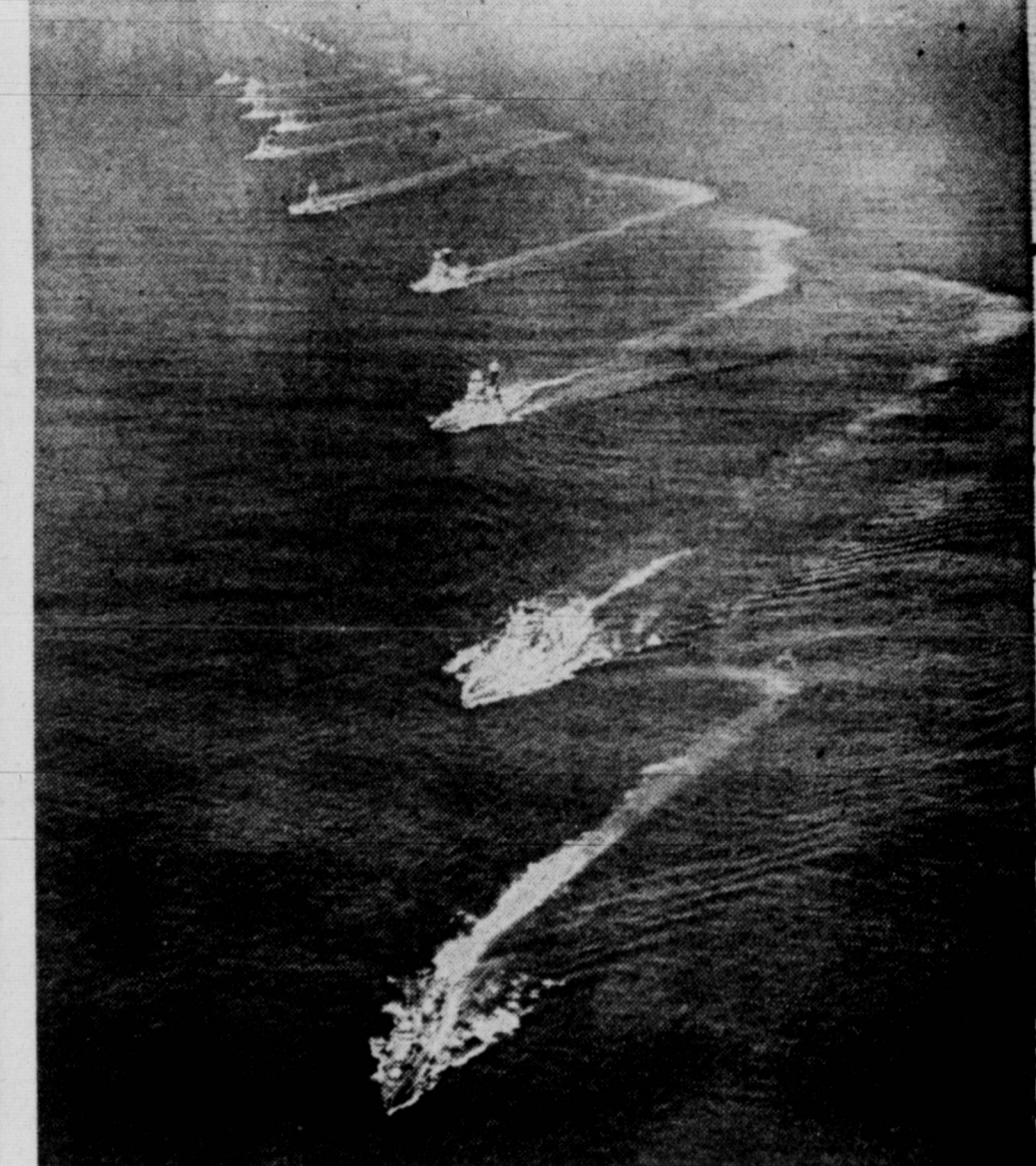
from line to half starboard, to gain advantage of position in some