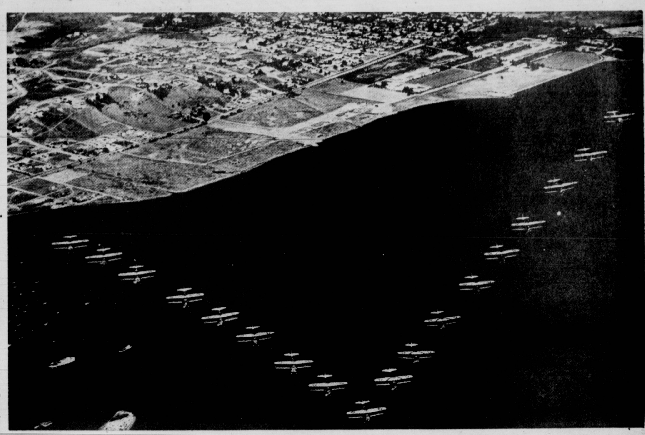
flyers. This formation of a scouting squadron not aloft, seeking out forces of the enemy. best in the world, both in men and planes.