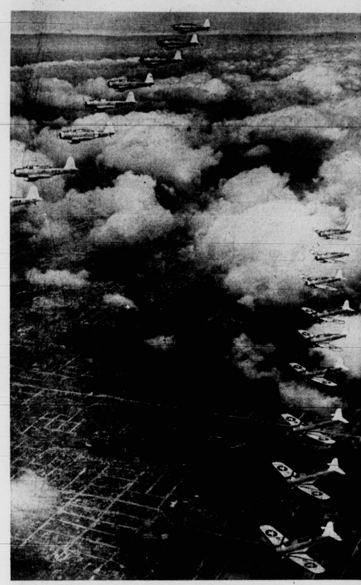
tion flying with wings almost touching wings. Each plane, in "tight" formations,