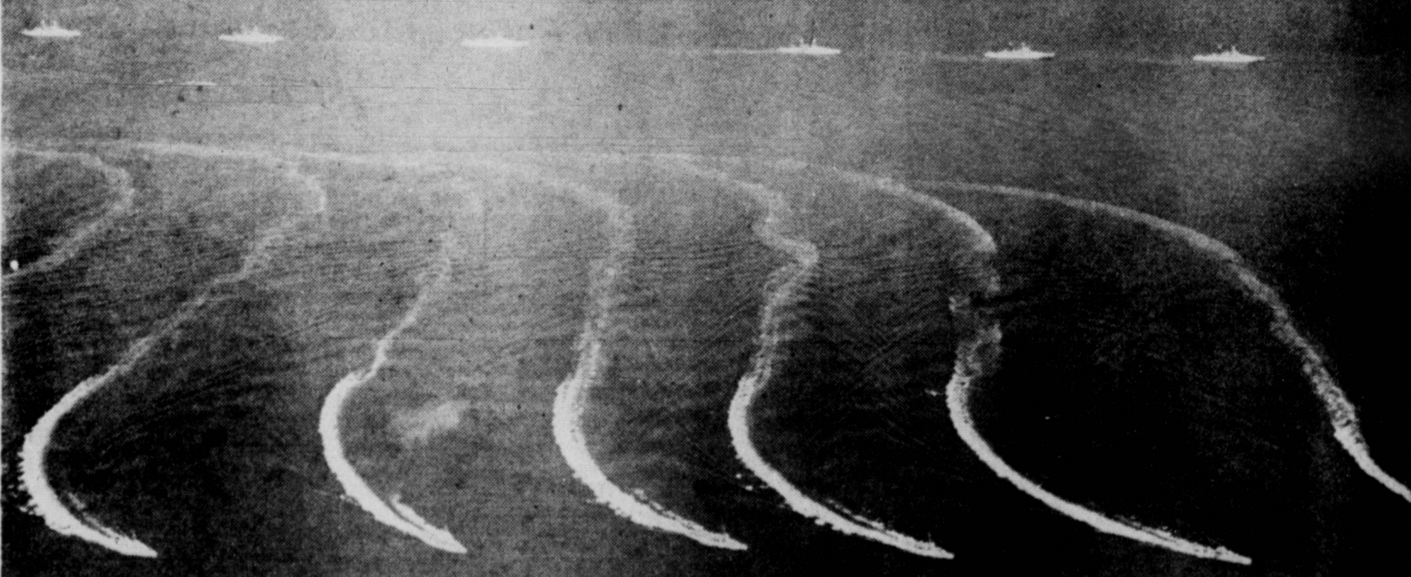
Destroyers of the inner submarine defense intricate maneuver to ward off submarine attorpedoes at heavy enemy craft. They screen swing sharply to starboard and then to tack on the main battleship and cruiser line in protect the heavier craft from submarines. port (right and then left to landlubbers) in an the horizon silhouette in the background.