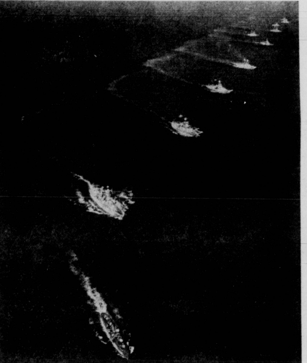
is faster than the battleships that follow her, but the heavy armored battleships can toss ton shells 20 of fighting ship.