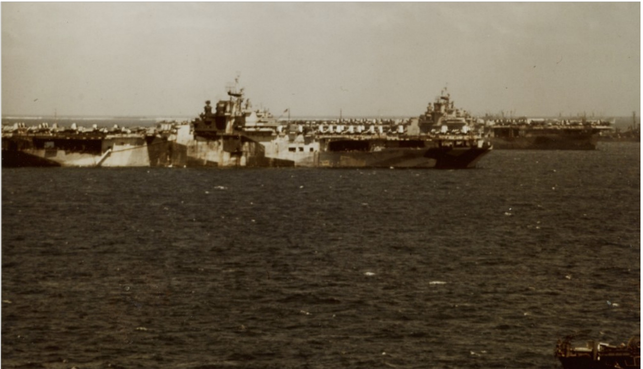
13 March 1945: USS Hancock (CV-19) in #22 in front of USS Wasp (CV-18) in #29 (NHHC 80-G-K-3814).

These incredible color images at Ulithi were taken by the USS West Virginia (as captioned on the NHHC website). According to her war log she was anchored in berth #39 and on the 13 th March 1945 shifted berths at 0700 to the southern anchorage for gunnery practice before returning at 1600. It quite likely that these photos were taken in the late afternoon as the Franklin arrived around 0900 on the 13 th .