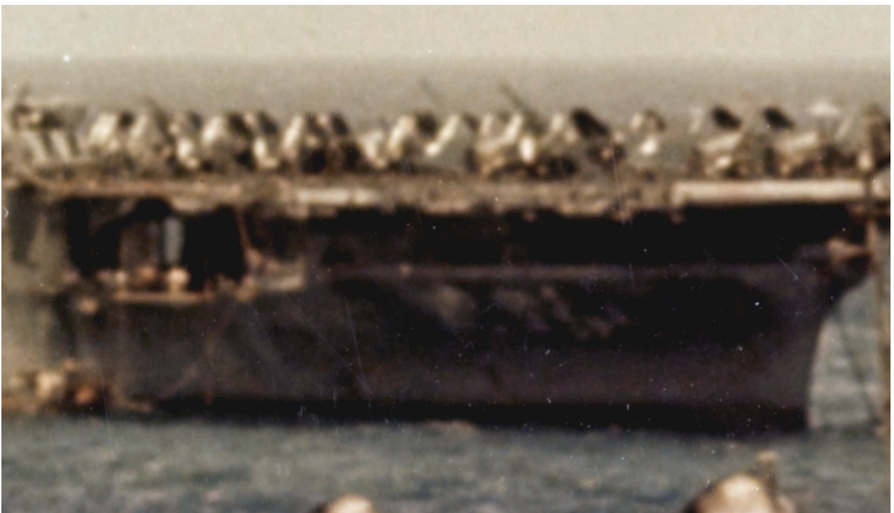
Franklin anchored at Ulithi, 13 March 1945 (cropped from 80-G-K-3815).