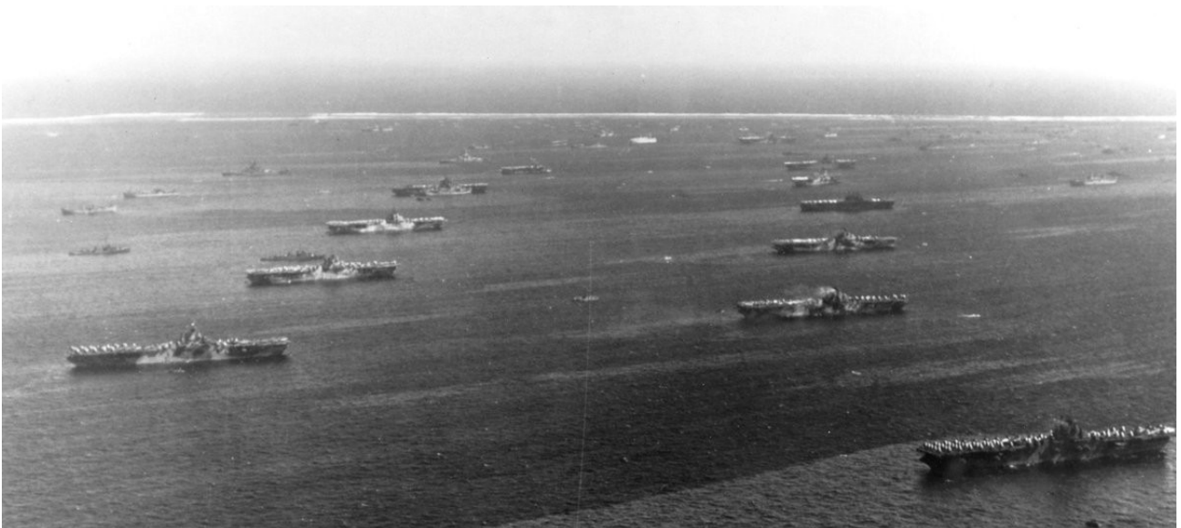
Probably the ultimate "Murderers' Row" photo with 10 Essex Class carriers plus the Enterprise in the anchorage. It must also have been taken on the 13 th March 1945 shortly after the arrival of Task Group 12.2. The Randolph in berth #27 had been hit two days previously whilst at anchor by a long range kamikaze strike. The repair ship USS Jason (AR-8) is visible alongside.

This identification enables us to connect it to other pictures taken at the same time with help of the Ulithi mooring plan.