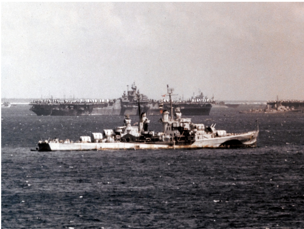
Cropped picture from the previous image showing USS Flint in front of USS Intrepid. USS Tennessee (BB-43) is just visible in #7 behind Intrepid's bow.