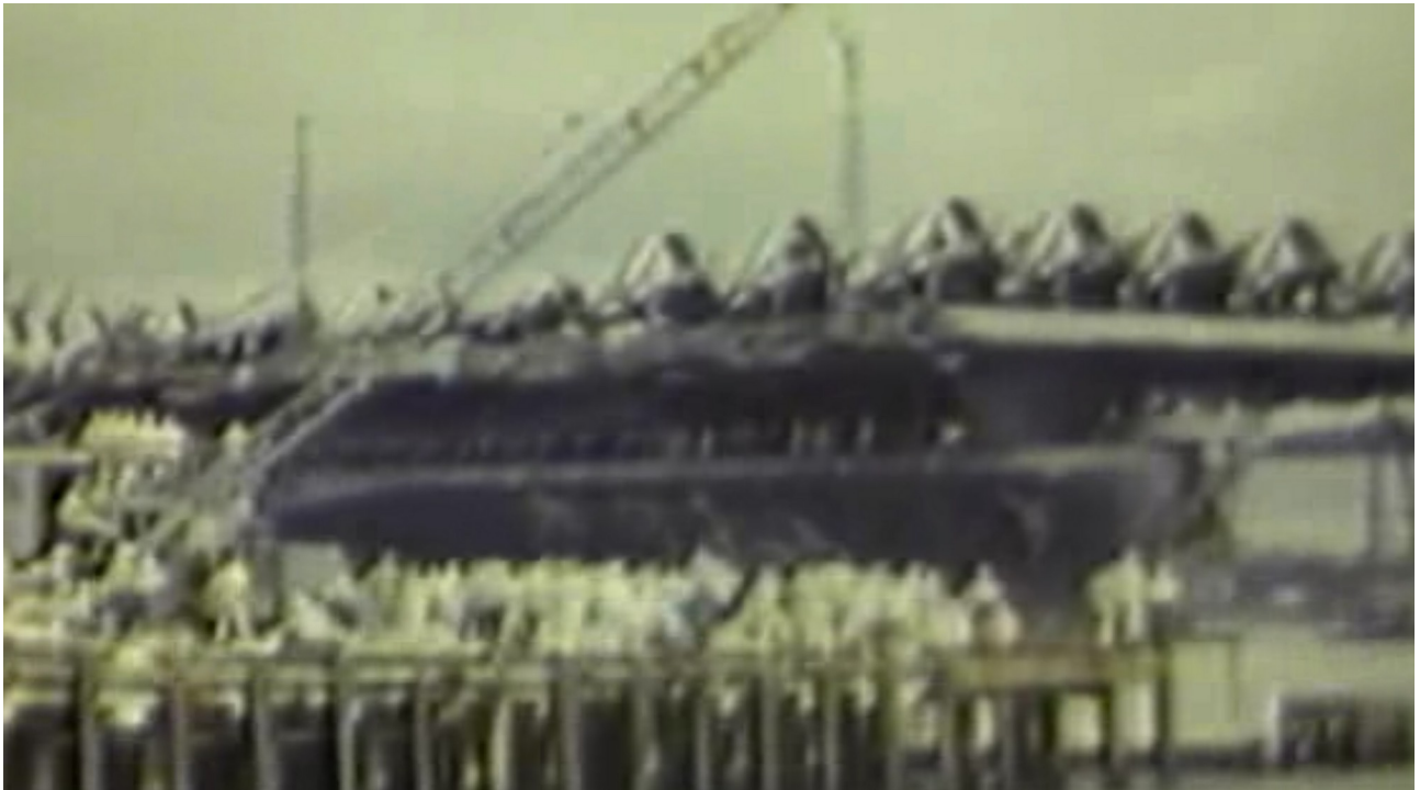
Franklin pulling alongside Fox-2 at Pearl Harbor on 28 Feb 1945 (still from National Archive reel: 428-npc-8601).