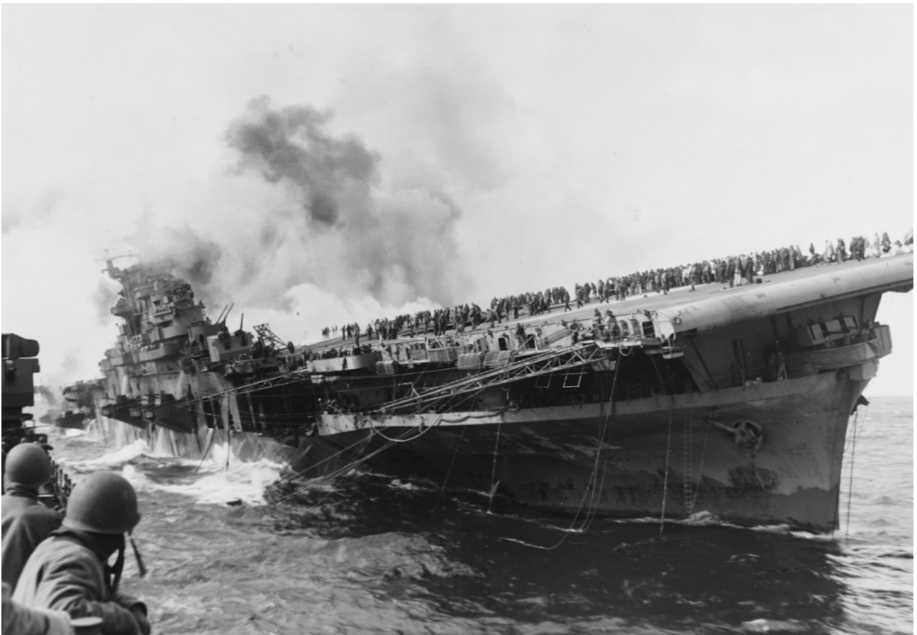
Franklin burning and listing in Japanese waters on 19 March 1945.

This identification enables us to connect it to other pictures taken at the same time with help of the Ulithi mooring plan.