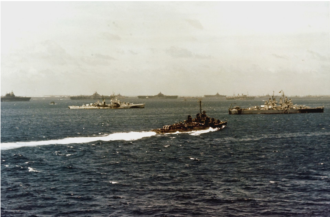
13 March 1945: USS Shannon (DM-25) crosses in front of USS Flint (CL-97) and USS Miami (CL-89). In the distance (L-R) is the Enterprise in #24, Intrepid #25, Essex #26 and Bunker Hill #8.