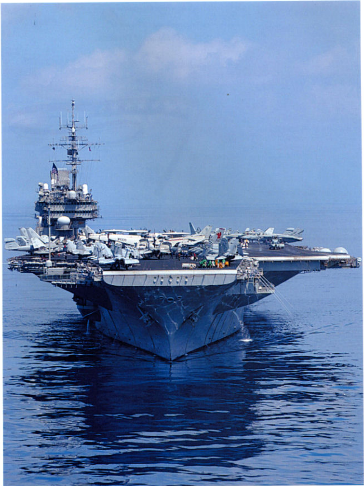
USS CONSTELLATION (CV 64) in the North Arabian Gulf, on Christmas Day, December 25, 2002.