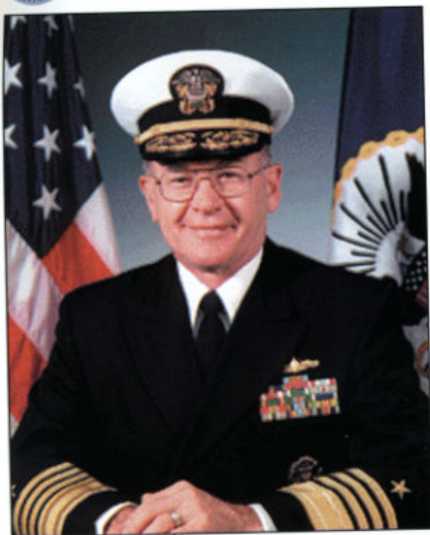
CHIEF OF NAVAL OPERATIONS