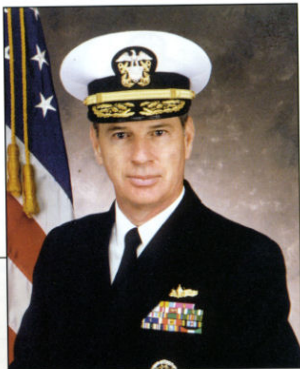
COMMANDER CRUISER DESTROYER GROUP ONE