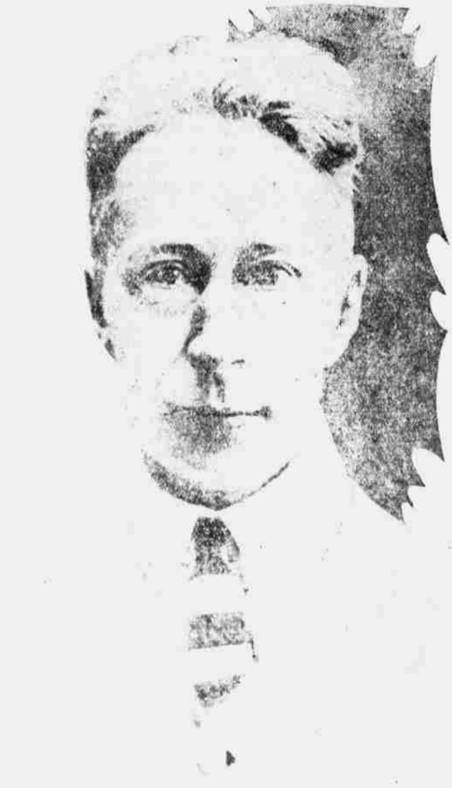
In the Prussian diet a deputy charged that the former German crown prince (above) kept a young girl a prisoner in his castle at Oels, Germany, and that the girl's father, a railroad engineer, was declared insane after he tried to rescue daughter.