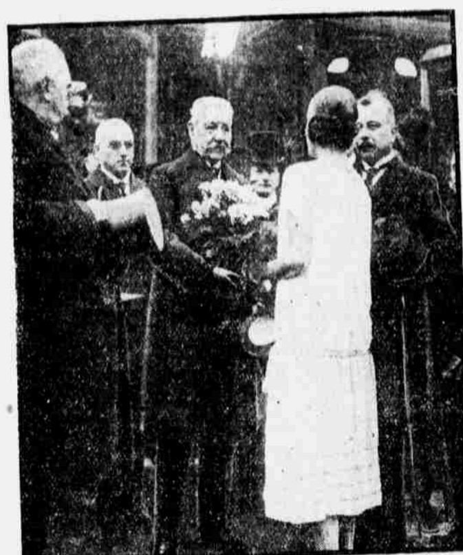
Accompanied by several cabinet members, President von Hindenburg recently toured the evacuated Ruhr cities. Photo was taken as he was presented with flowers at Bochum.