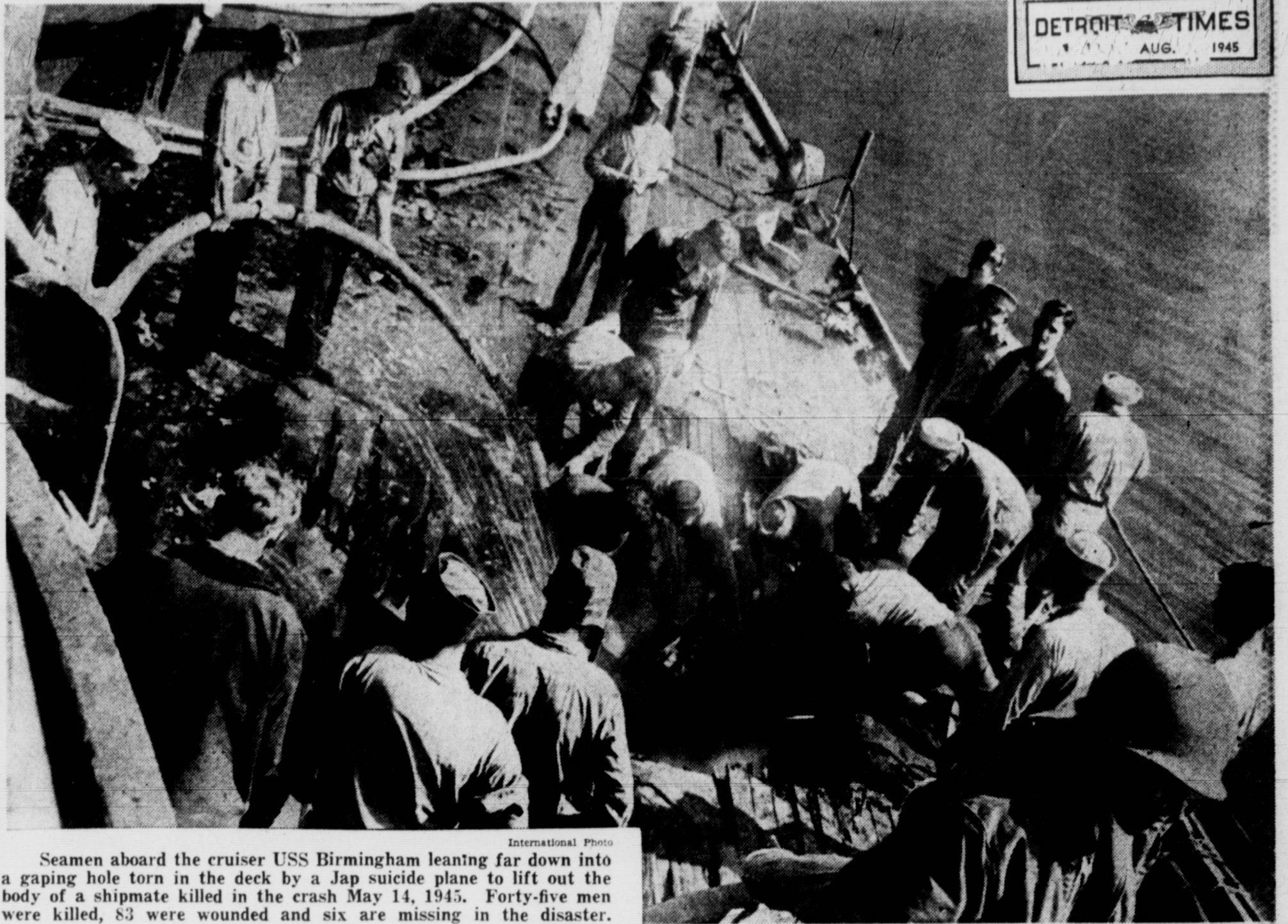
Seamen aboard the cruiser USS Birmingham leaning far down into a gaping hole torn in the deck by a Jap suicide plane to lift out the body of a shipmate killed in the crash May 14, 1945. Forty-five men were killed, 83 were wounded and six are missing in the disaster.

PICTORIAL REVIEW DETROIT TIMES AUG. 1945