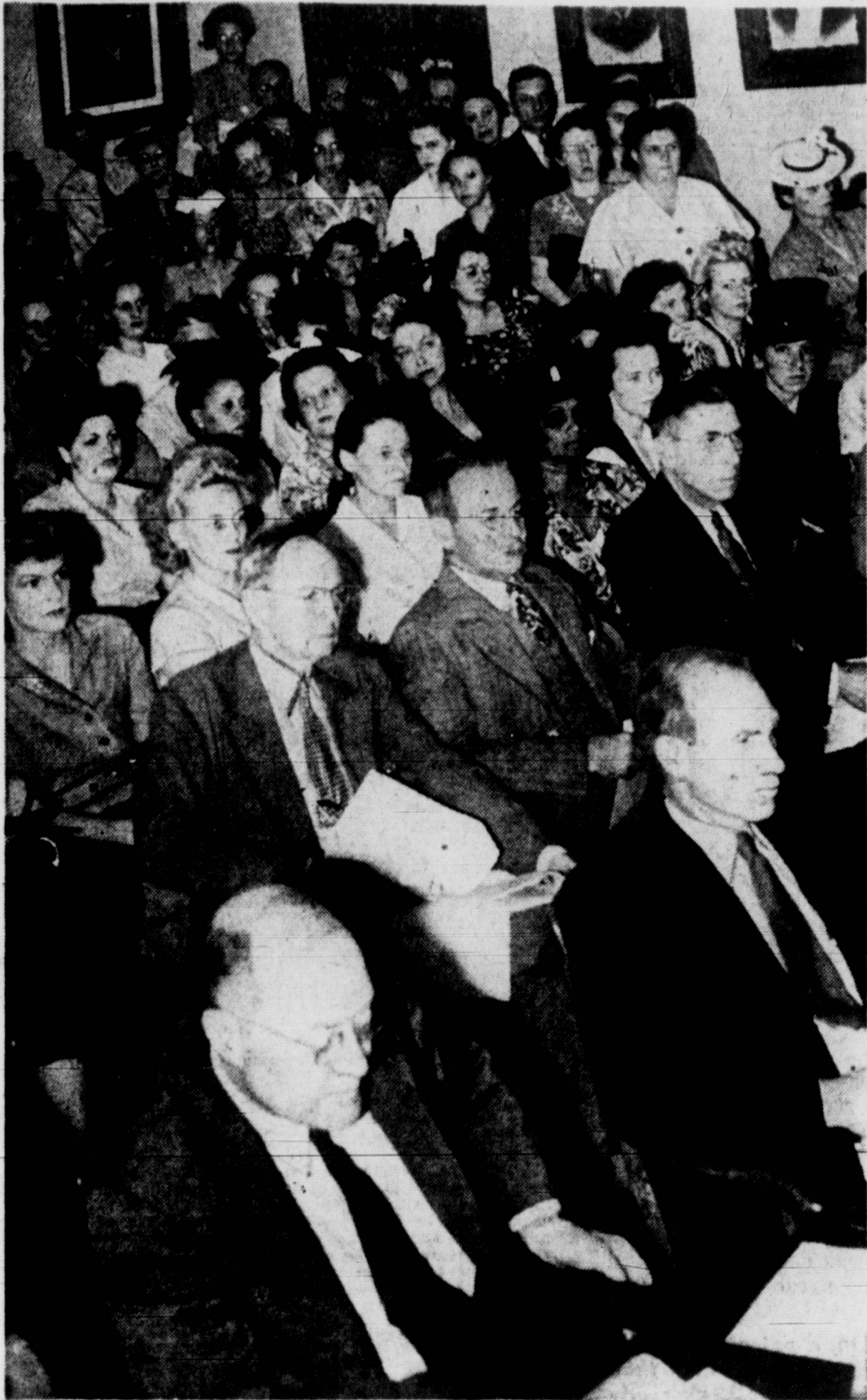
Part of the large crowd of mothers who pleaded for the continuation of nursery schools before the Detroit Board of Education listening, with members of the board, to one of the protests. The board promised its help.