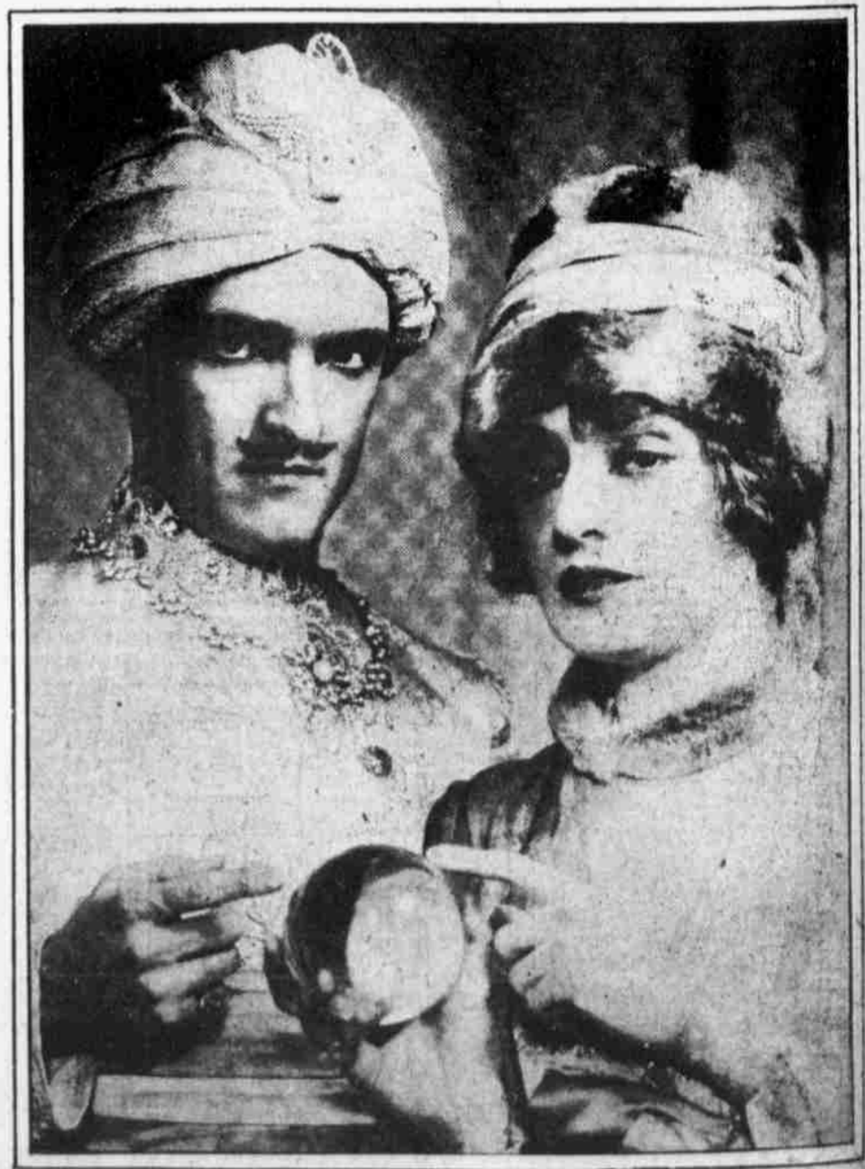
NORA BAYES AND IRVING FISHER are seen, respectively, as Polly Wren and the Hindu in "The Eyes of Youth" in the George M. Cohan Revue at the Forrest Theatre.