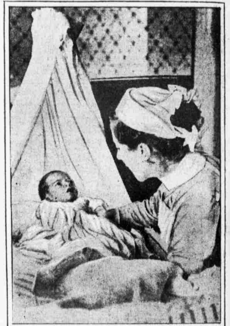
SIR DOUGLAS HAIG'S BABY BOY was born March 16, and he is a bouncing youngster, as this first photograph shows.