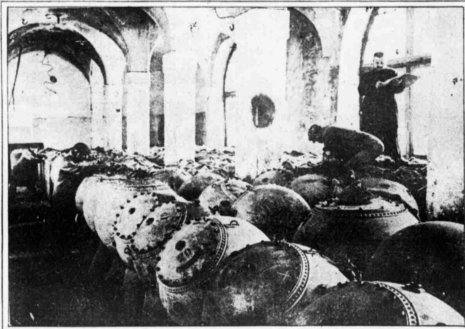
FRENCH SUBMARINE MINES look deadly enough to keep the entire German navy in harbor. They are here receiving the finishing touches.