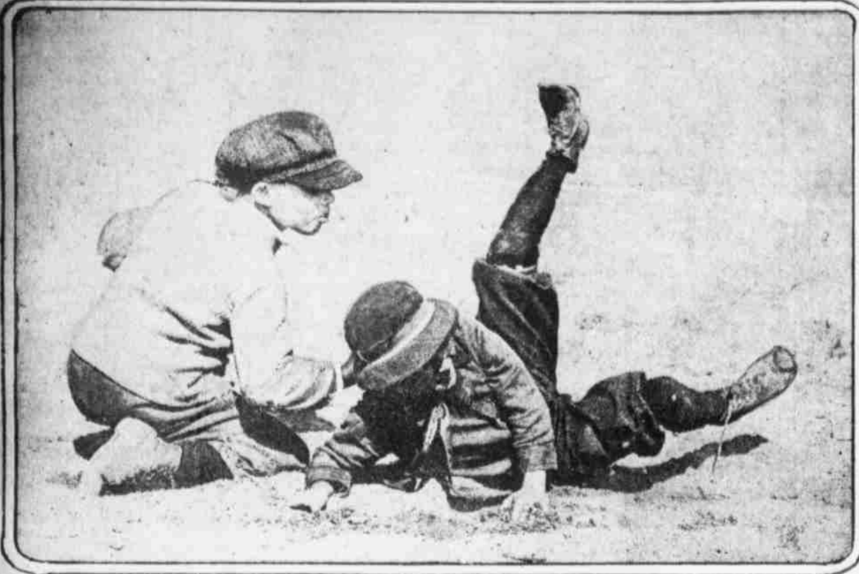
SAFE AT FIRST, although a mighty close call for this baseman in a back-hit game.

FEATURES OF INTEREST GLEANED FROM THE HIGHWAYS AND BYWAYS OF A BUSY WORLD BY THE CAMERA