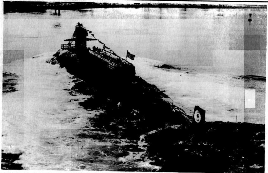
Nuclear attack submarine GRAYLING (SSN646) was launched June 22, 1967 from Shipbuildingways