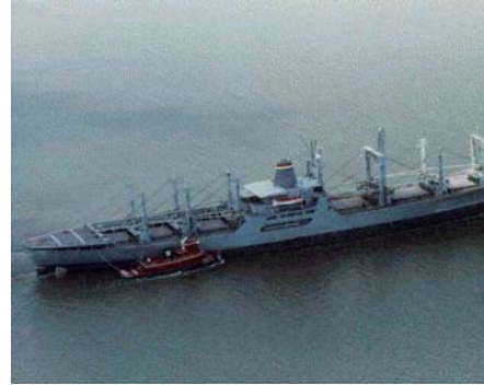
Left: SS African Neptune, later renamed Cape Archway, moored at the James River Reserve Fleet in Virginia. Right: SS Cape Archway underway.