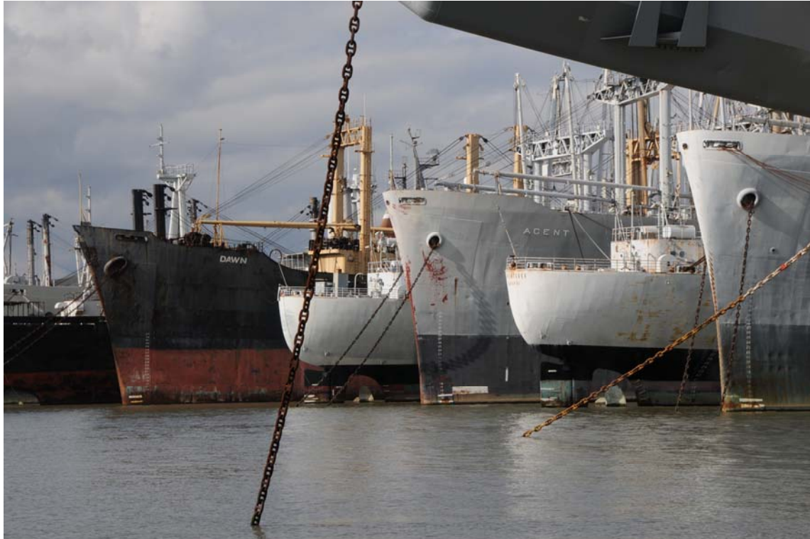
SS Agent (fourth from left) at the Suisun Bay Reserve Fleet, Benicia, California, February 2009.