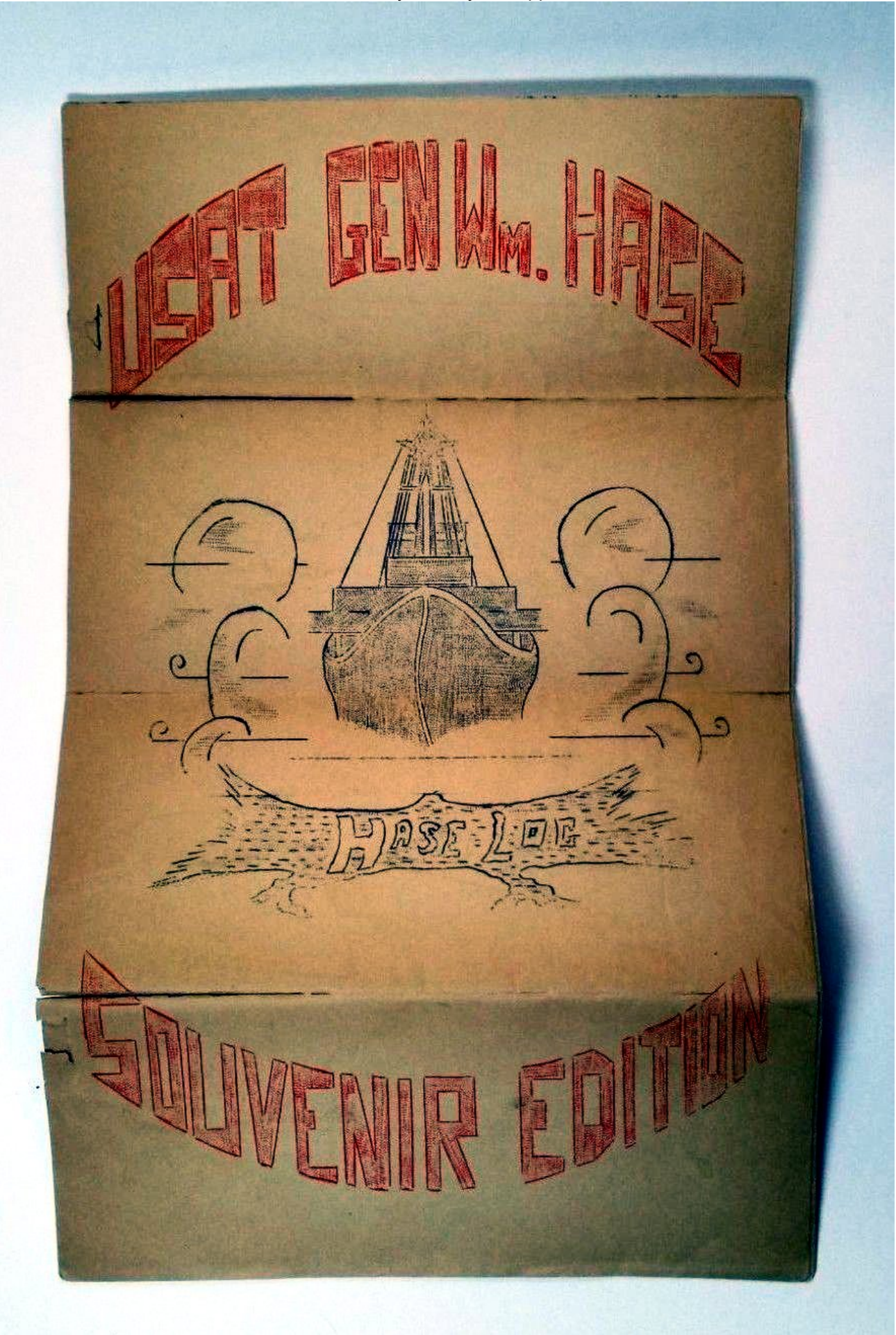
Contributed by Tommy Trampp