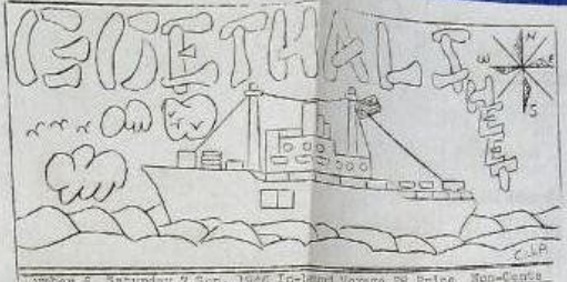
Water 6 Saturday 7 Sep. 1939 In-land Voyage 28 Price. Run-Cards