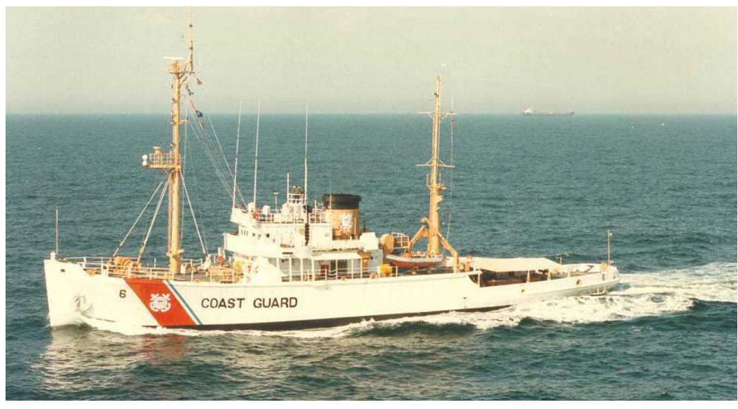
USCGC Escape (WMEC-6)