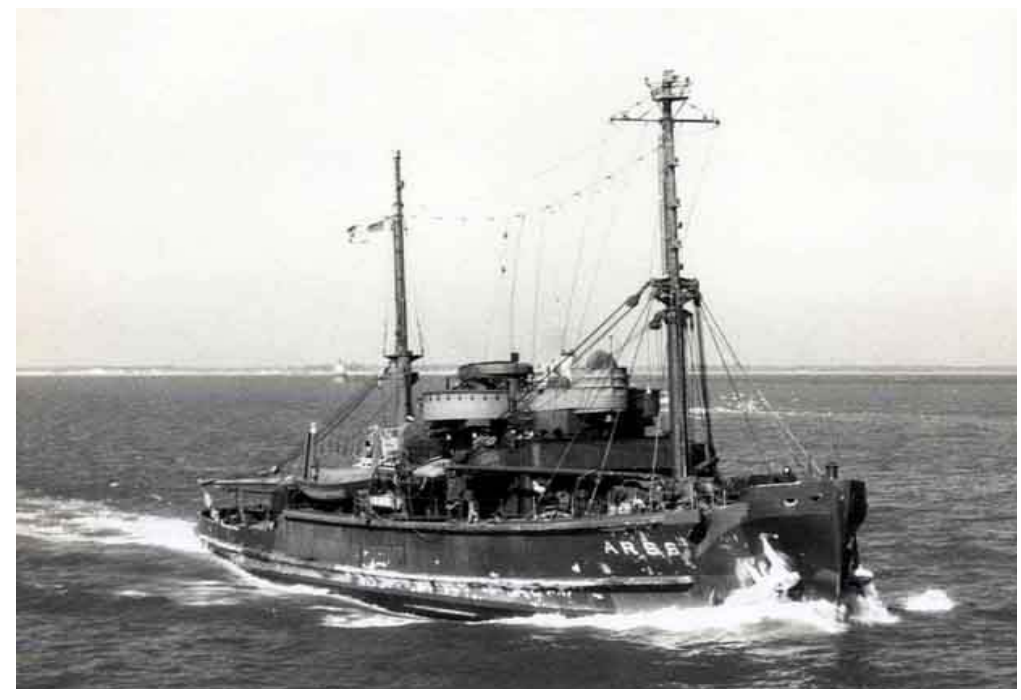
USS Escape (ARS-6) underway in 1946. <u>www.nafts.net/ars6.htm</u>. Contributed by Craig Rothhammer.