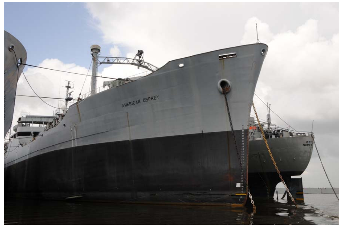
American Osprey in Beaumont, Texas, June 26, 2008

Type: OPDS (Offshore Petroleum Discharge System) Tanker Hull Number: T-AOT 5075 Official Number: 276034 Year: 1958 Former Name: Gulf Prince Location: Beaumont, TX Last Owner: Chevron Builder: Bethlehem Steel Company, Sparrows Point, MD. Length: 661' Beam: 90.40' Depth: 45.40' Draft: 35.66' Displacement: 44,840 Gross tonnage: 20,143 tons Dead Wt: 34,723 tons Cargo Capacity: 235,000 Bbls. Propulsion: Steam Turbine HP: 15,000 shp Speed: 17 knots Propulsion System: Two Cyl Steam Turbines