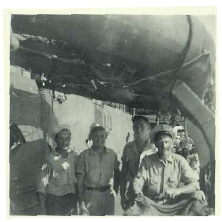
LST crew members