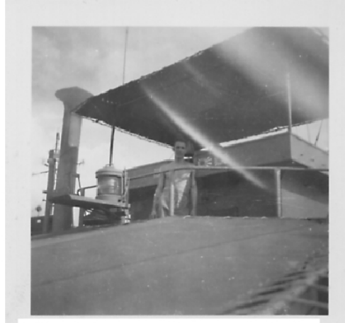
LST. 26 JB Simms (3 Insignias / Bridge)