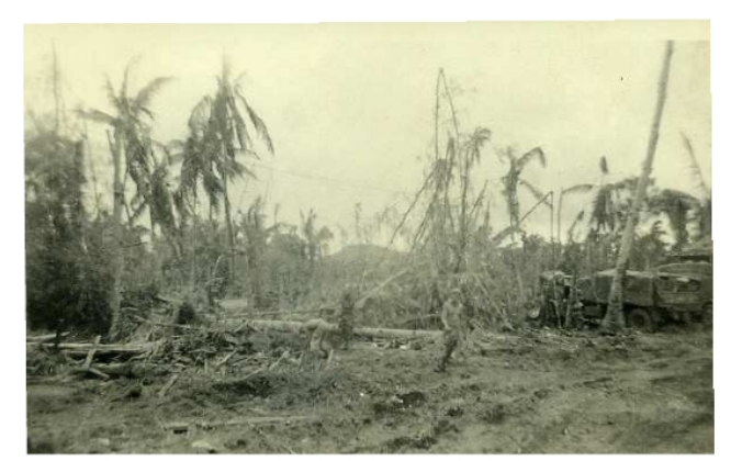
Philippine Beach Head