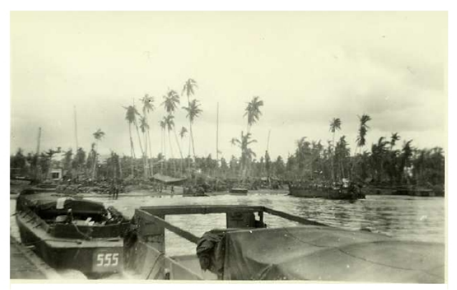
South Pacific Beach Head