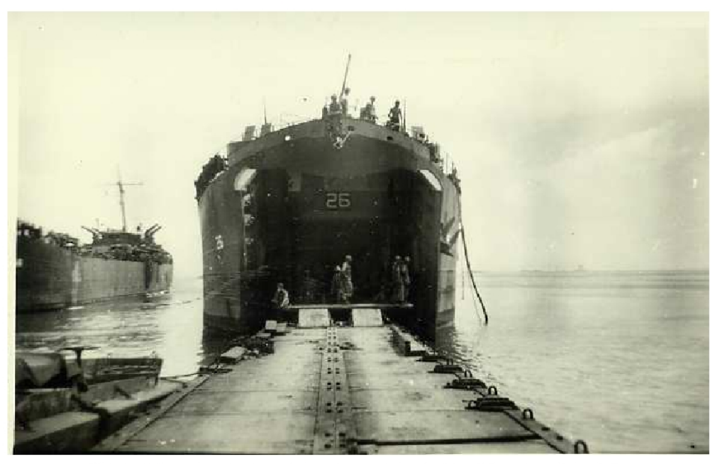
LST 26 Invasion in the Philippines at Layte Gulf October 20, 1944