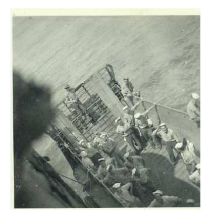
LST crew members