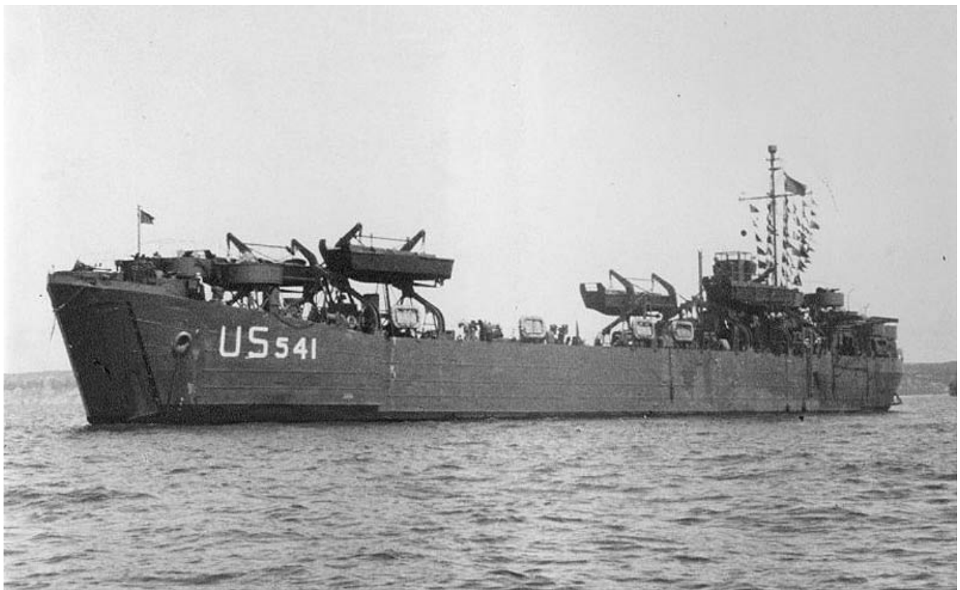
Although no photographs of LST-531 appear to have been preserved, LST-541 was one of the same type of LST and was constructed in the same shipyard in Evansville, Indiana

tion of the ship began there in September, 1943, and the vessel was launched two months and two days later in November. She was 328 feet long and 50 feet wide, with a displacement of 1,780 tons. Unloaded, the draft of the vessel was 2 feet 4 inches at the bow and 7 feet six inches at the stern; this increased to 8 feet 2 inches at the bow and 14 feet 1 inch in the stern when loaded with cargo. Equipped with two General Motors 12-567 diesel engines, running two shafts with twin rudders, she could do 12 knots. The LST-531 was designed for a crew of 10 officers and between 100-115 enlisted men.