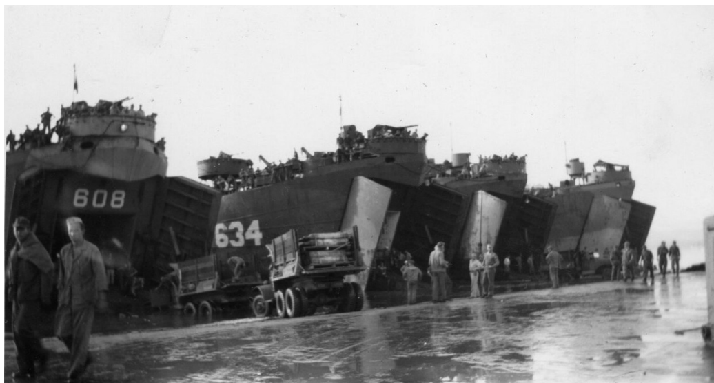
LST 634, LST 608, and others at Subic Bay Philippines.