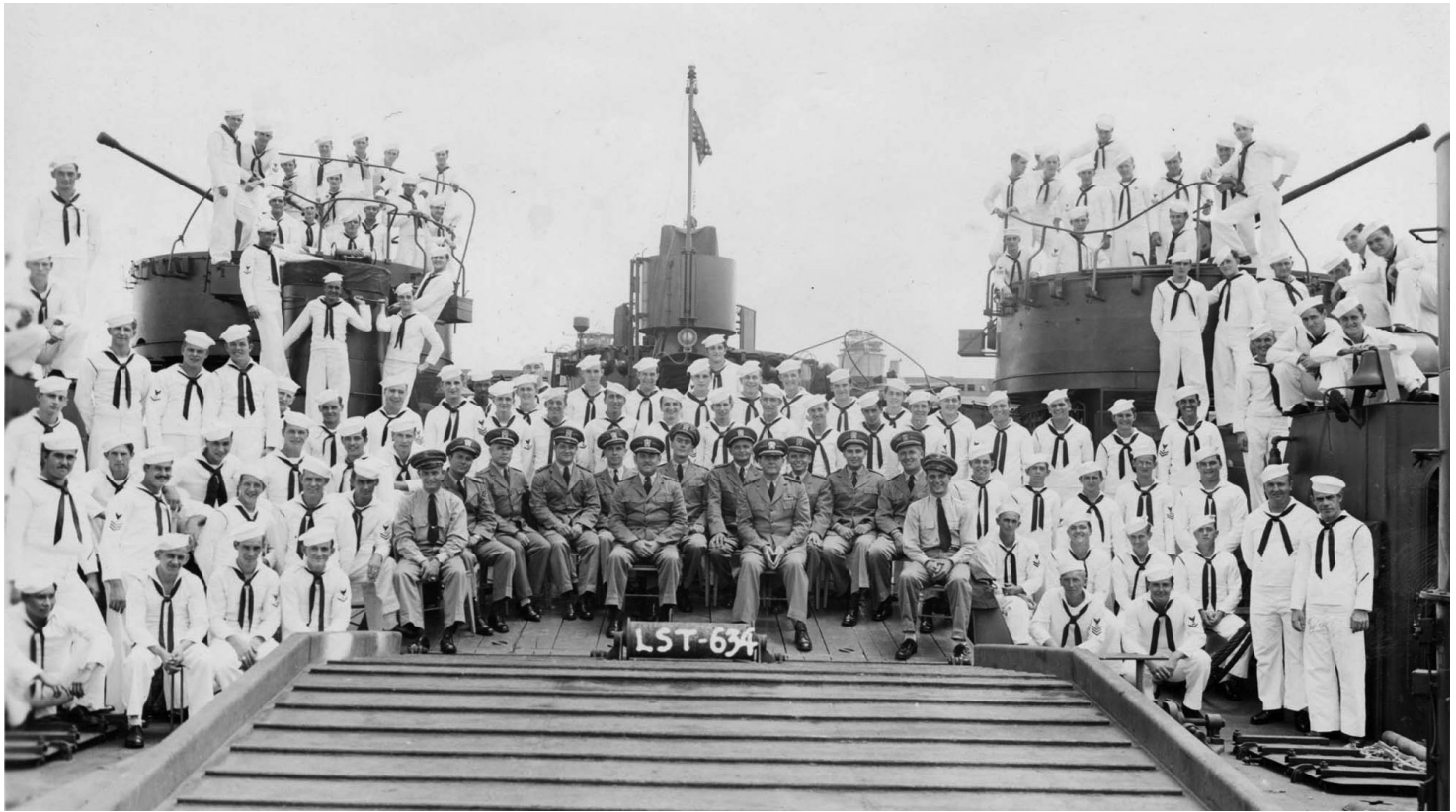
The ship's Company