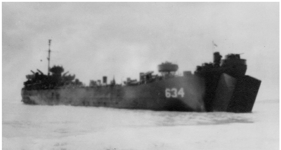
The USS LST 634