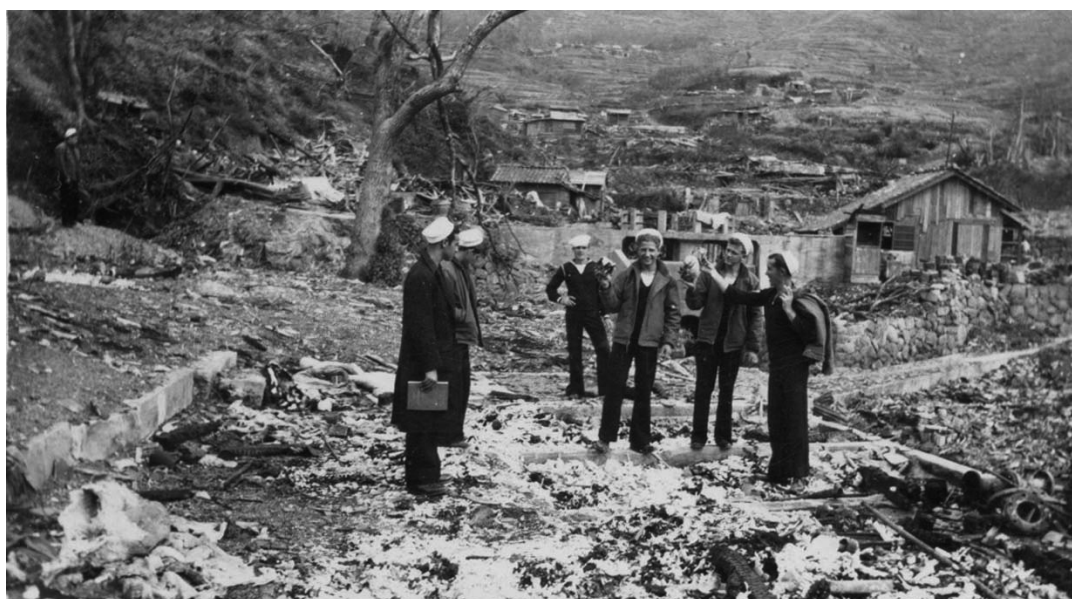
Shipmates of LST 634 in and around Nagasaki.