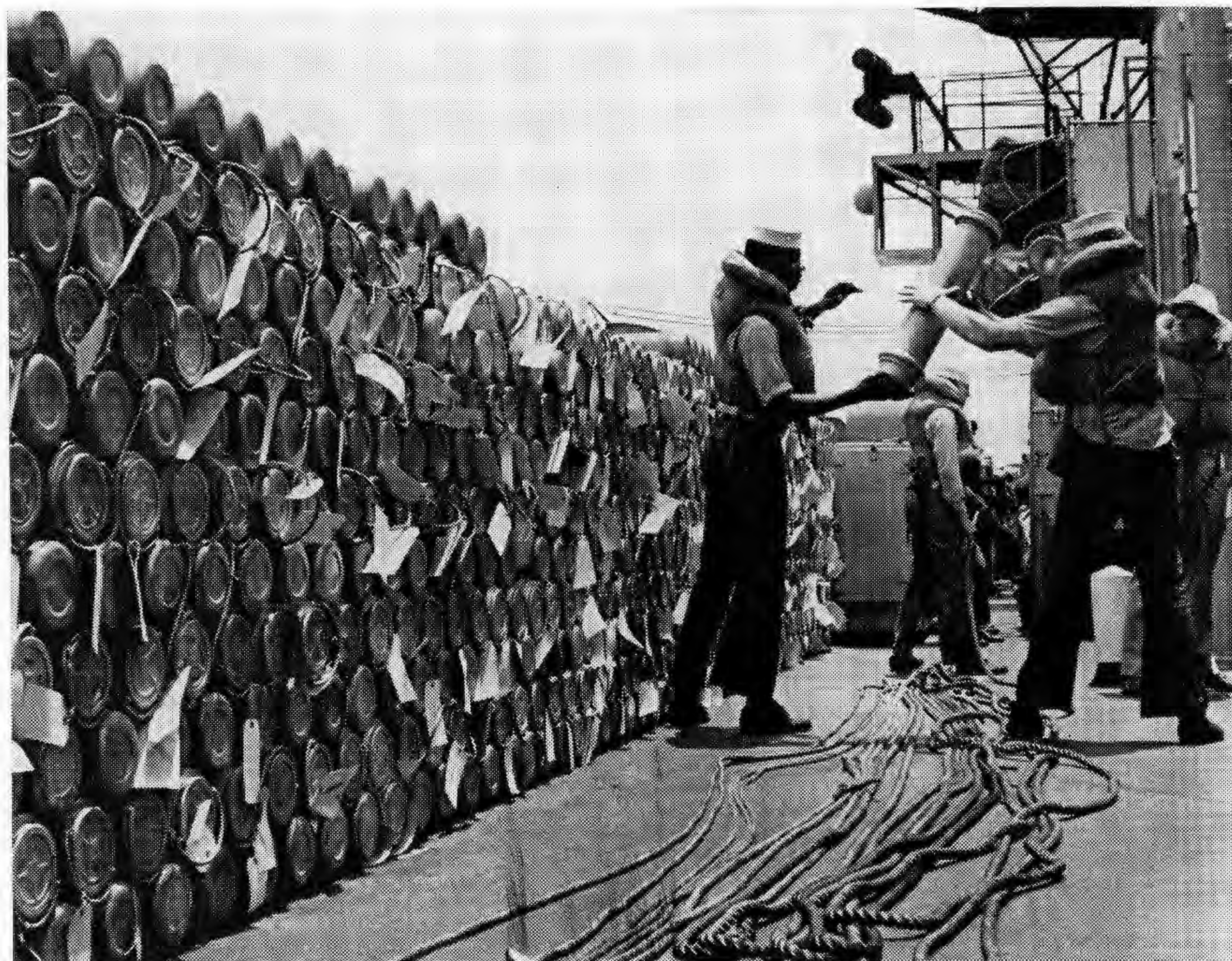
Destroyers, with their 5-inch guns, are performing the same gunfire tasks today as they did over 20 years ago. They are the alter egos of the maneuvering battalion landing teams, working with—and supporting them—directly.

Only actual combat experience can determine the true capabilities of the IFS, or of a modernized and expanded version of the IFS, but it is unfortunate that a ship of such a recent design was deprived of valuable training experience during the past few years. It is even more frustrating when viewed against the background of the “gun gap” that existed during the Cuban Crisis of 1962, when the Navy’s amphibious force planners and those