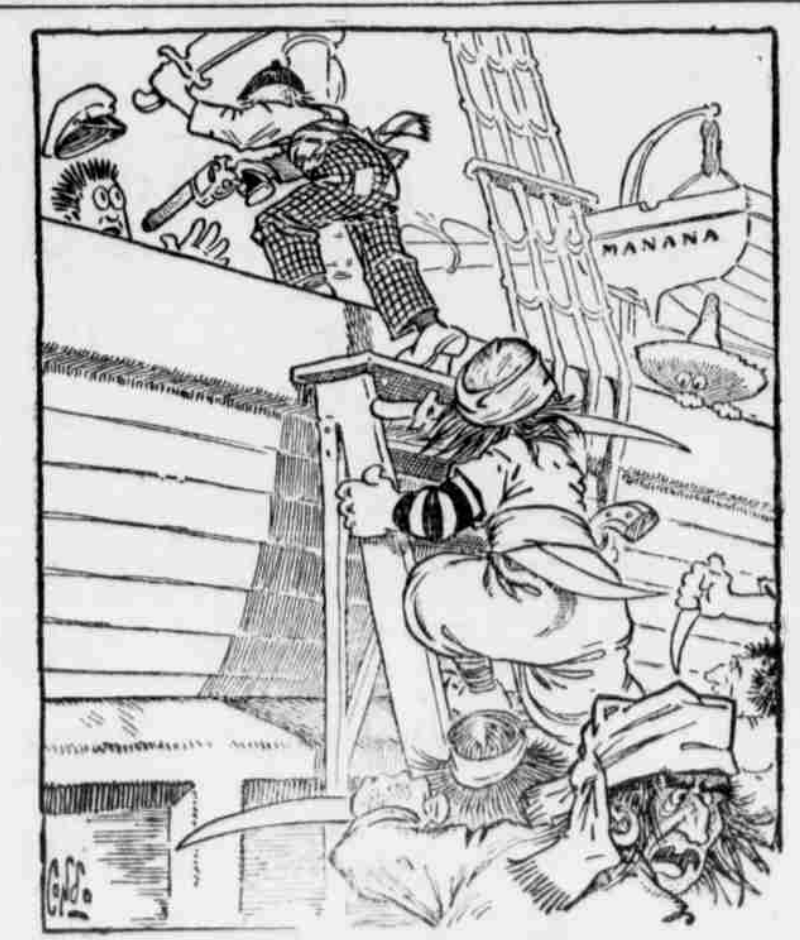
"SURRENDER!" C RIED OUR HERO.

Japan the most unusual activity is visible everywhere. Every available mechanic that can be secured for the various departments at the yard is being utilized, and the mammoth structures, of which there are 14, are veritable been hives of industry and rush. Three of Uncle Sam's most powerful fighting machines, viz., the Oregon, the newly completed Nebraska and the Wisconsin, are now undergoing repairs there, while the cruisers Albany. Chicago and Boston are being overhauled. The Buffalo has arrived with crews and supplies for the Nebraska and Albany. Cool Problem. The question of coal for the warships has recently undergone a marked change. Heretofore Cardiff, or Welsh coal, and that from Comox. B. C., has been used almost exclusively, but the department is experimenting with semi-bituminous coal from Lambert, W. Va., 20,000 tons of this product having been purchased. A German steamer is expected here with 6,000 tons August 14. The