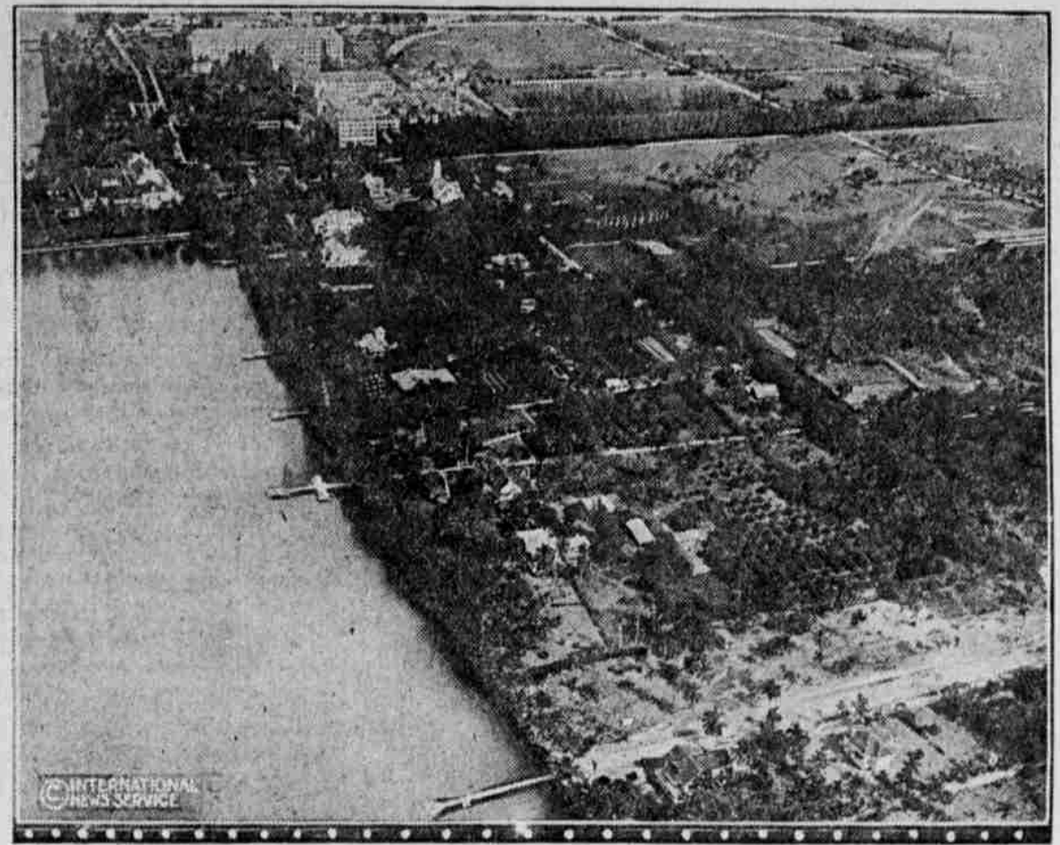
This photograph of Palm Beach, Fla., was taken from an aeroplane in flight over the city