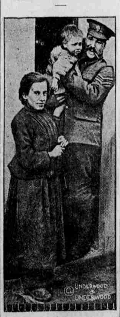
The British soldier is notoriously kind to children, and one of his majesty's soldiers is here seen belp-(Cal.) district, fought for his life a ing a poor French peasant woman