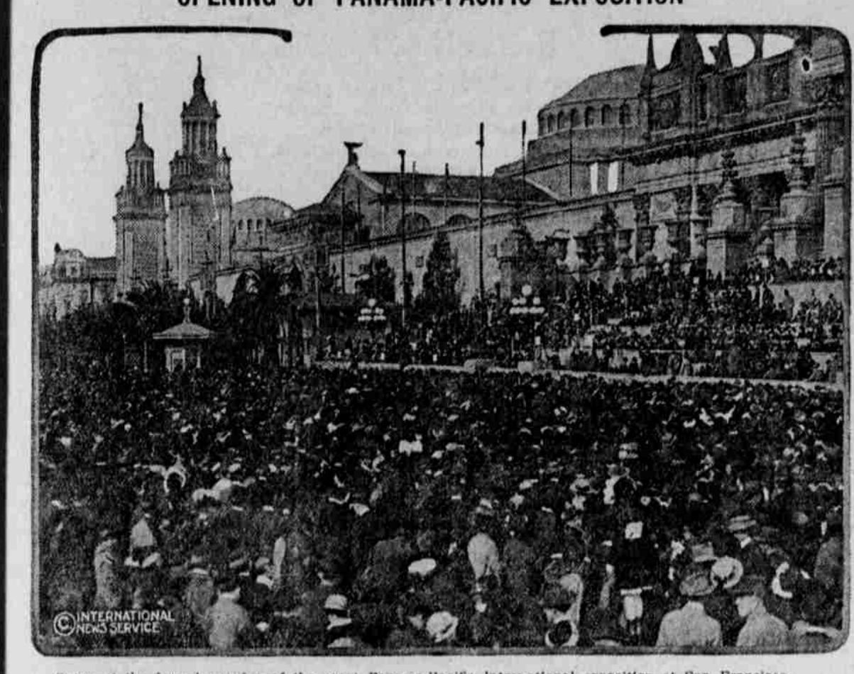
formal opening of the great Panama-Pacific International exposition at San Francisco.