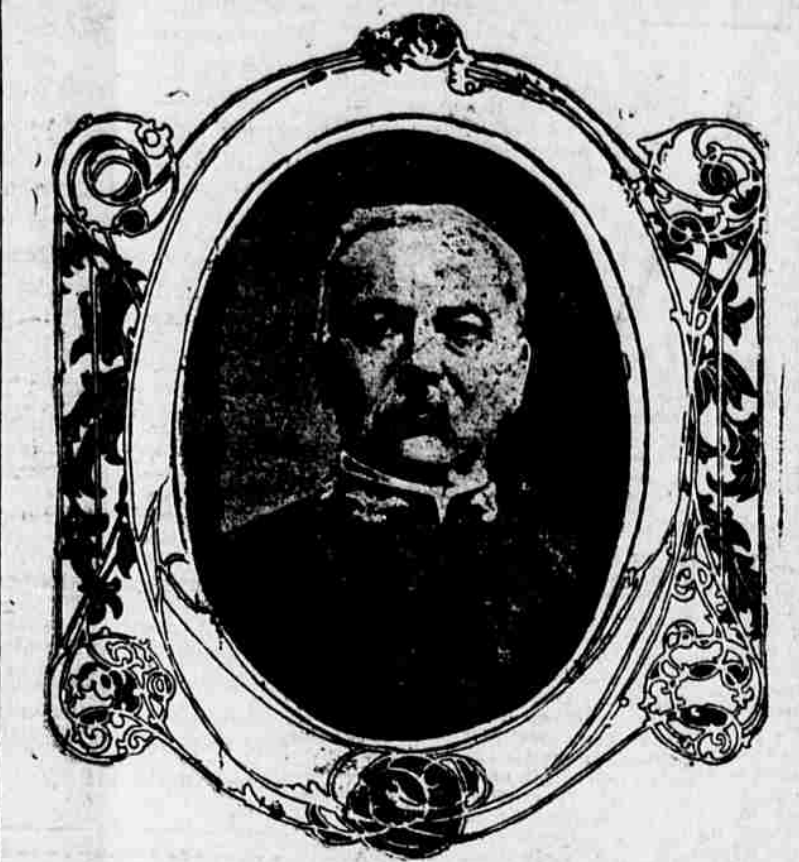
REAR ADMIRAL COOPER, IN COMMAND OF THE CRUISERS.