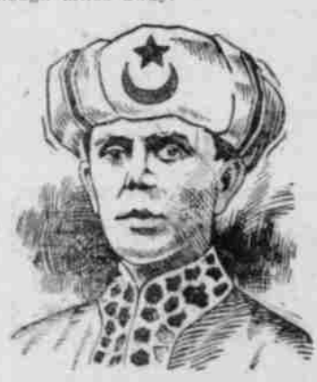
From 9 a. m. to 8 p. m.