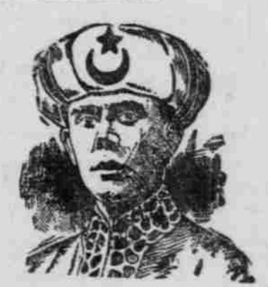
Readings Daily and Sunday, From 9 a. m. to 8 p. m.