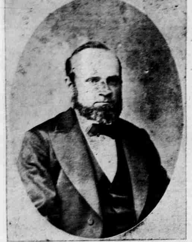
THE LATE JAREZ TURNER, EX-MAYOR OF SACRAMENTO, WHO BUILT A