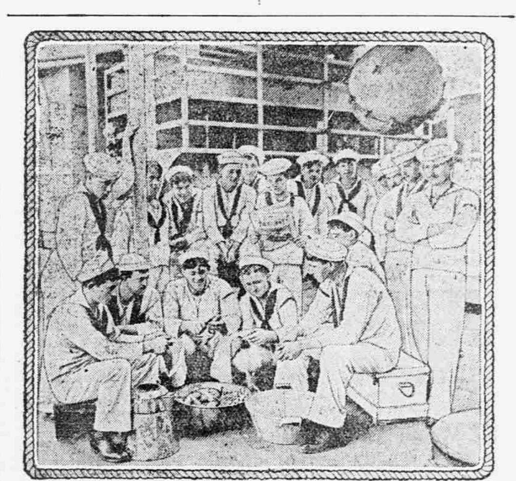
JACKIES PREPARING THE CHRISTMAS DINNER.

After dinner general leave is granted and in home ports many of the sail-Christmas dinner as a North American ors go ashore to visit relatives and friends. Most of the men, however, The navy's Christmas really begins and on a foreign station practically all, with sack races, three legged races and On Christmas morning the usual rou- athletic games which involve quick tine is omitted. During the forenoon work in going aloft and getting down