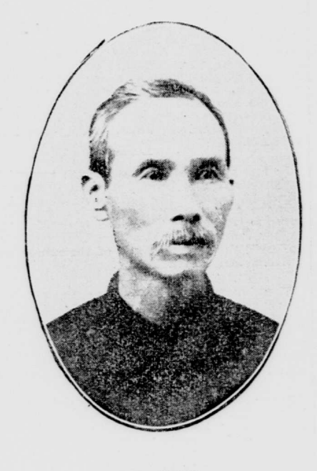
Wealthy Chinaman whose daughters married into American families.

Once the longest wharf in America, half a mile, and famous for the big business done on it; now deserted.