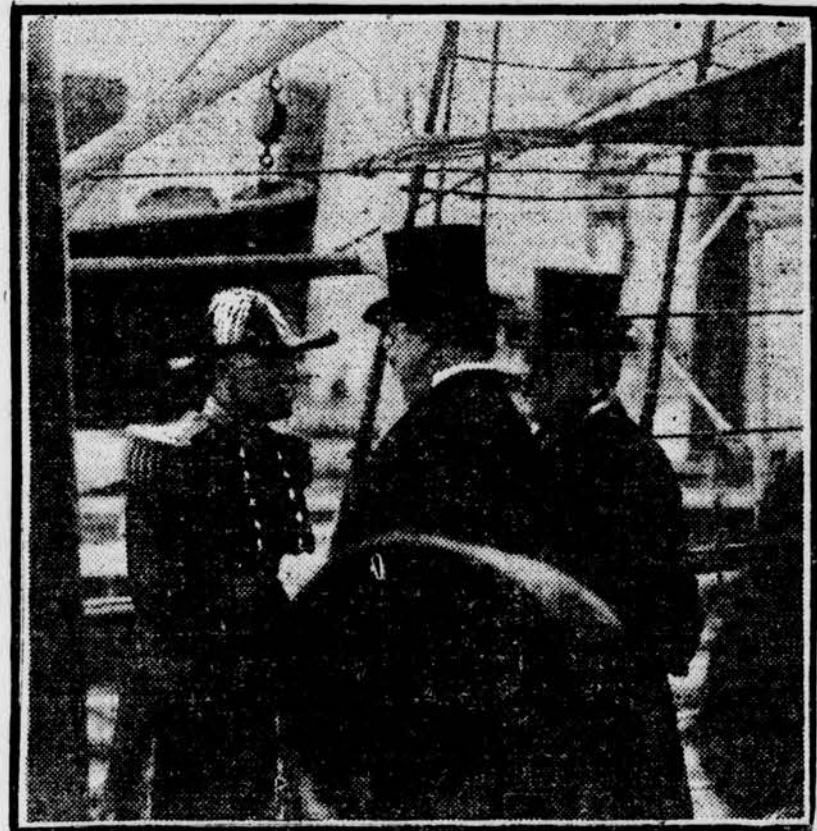
PRESIDENT ROOSEVELT (IN THE CENTER) AND ADMIRAL SPERRY ABOARD THE MAYFLOWER IMMEDIATELY AFTER THE FLEET DROPPED ANCHOR IN HAMPTON ROADS.