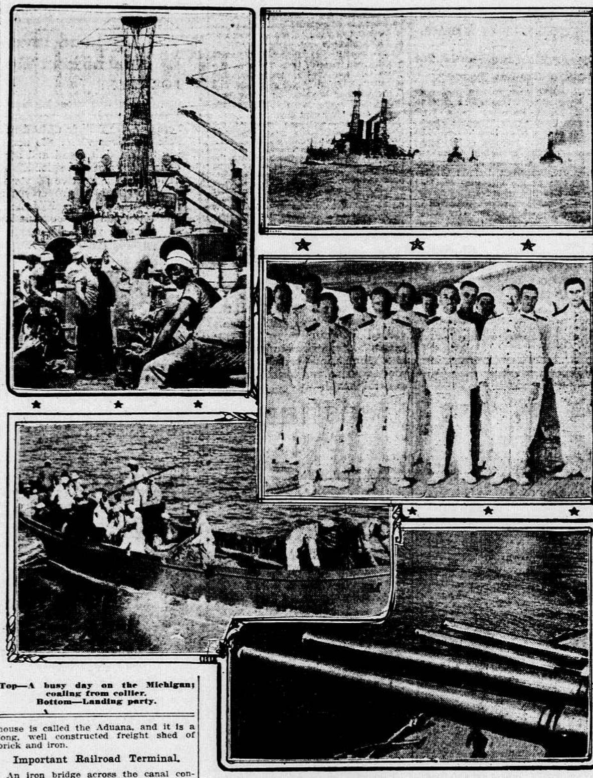
Top—A busy day on the Michigan coasting from Collier. Bottom—Landing party.