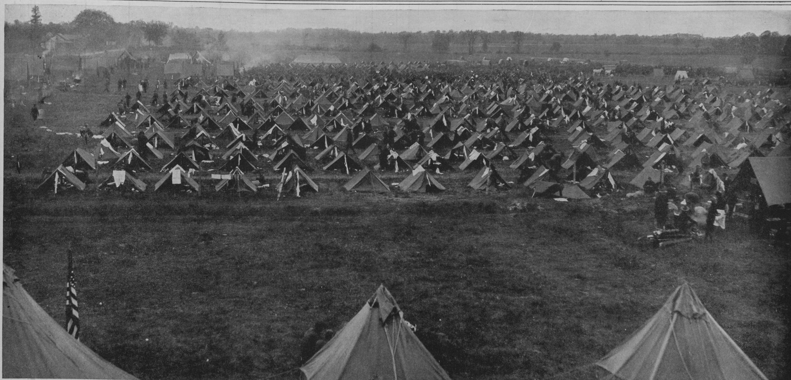
BUSINESS MEN OF THE PLATTSBURG ENCAMPMENT, IN THEIR FIRST WAR GAMES NEAR THE CANADIAN LINE, BIVOUAC AT COOPERSVILLE, N. Y.