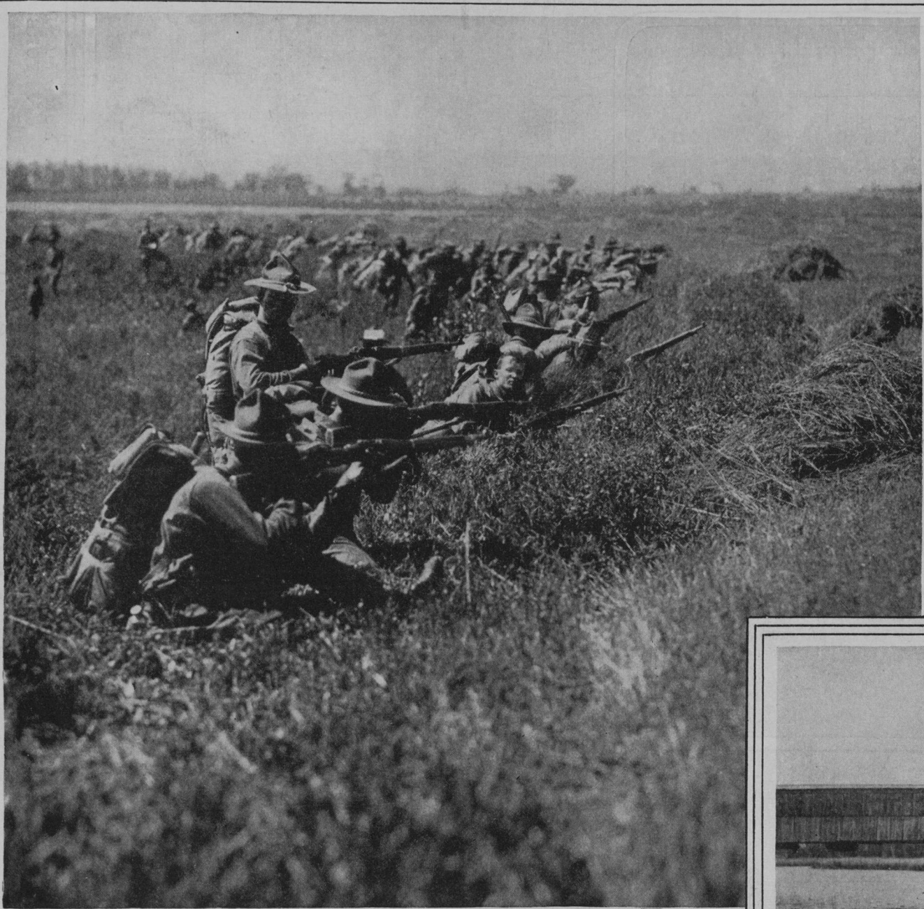
ON THE FIRING LINE IN A HAY FIELD NEAR THE CANADIAN LINE.