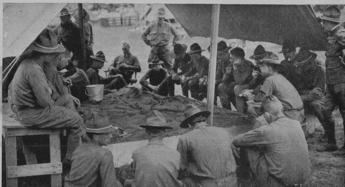
BUSINESS MEN'S CLASS IN ADVANCED INFANTRY STUDY SYSTEMS OF ATTACKS AND DEFENSES WITH SAND MODELS.