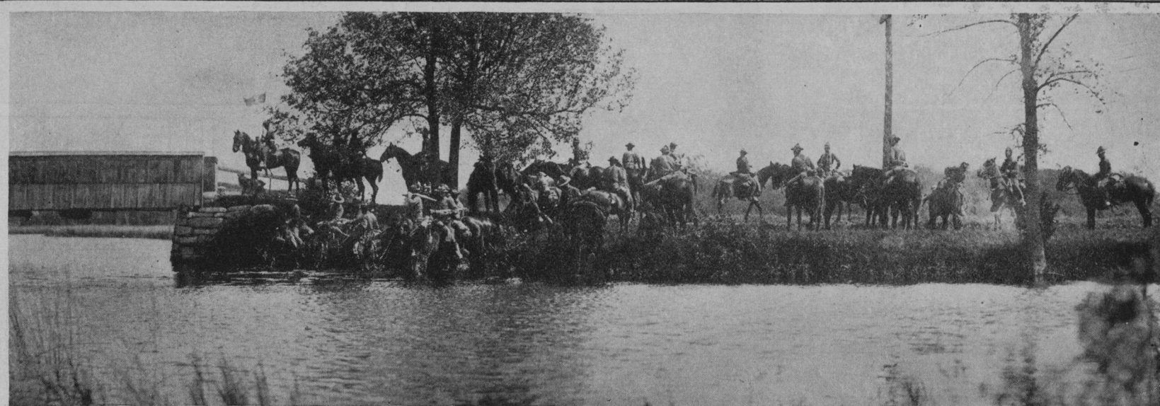
BUSINESS MEN'S CAVALRY FORD A RIVER TO AVOID A MINED BRIDGE.