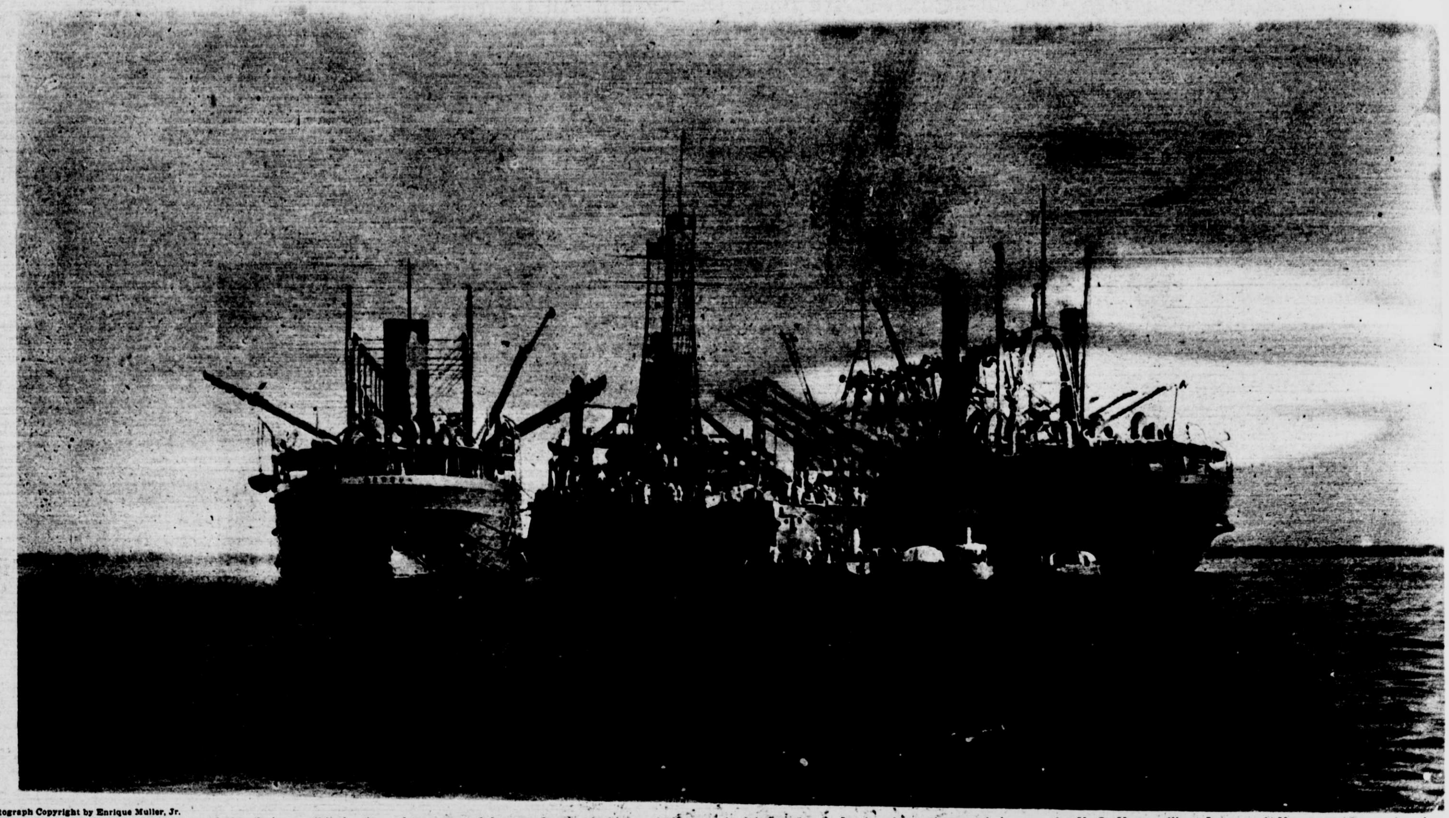
In a recent test it was demonstrated that it is possible in time of war to coal four or five battleships a day at sea in fair weather. In the above photograph is seen the U. S. Navy colliers Jason and Neros, on the starboard and port sides respectively, putting aboard the dreadnought Wyoming more than 2,200 tons of coal in less than three hours.