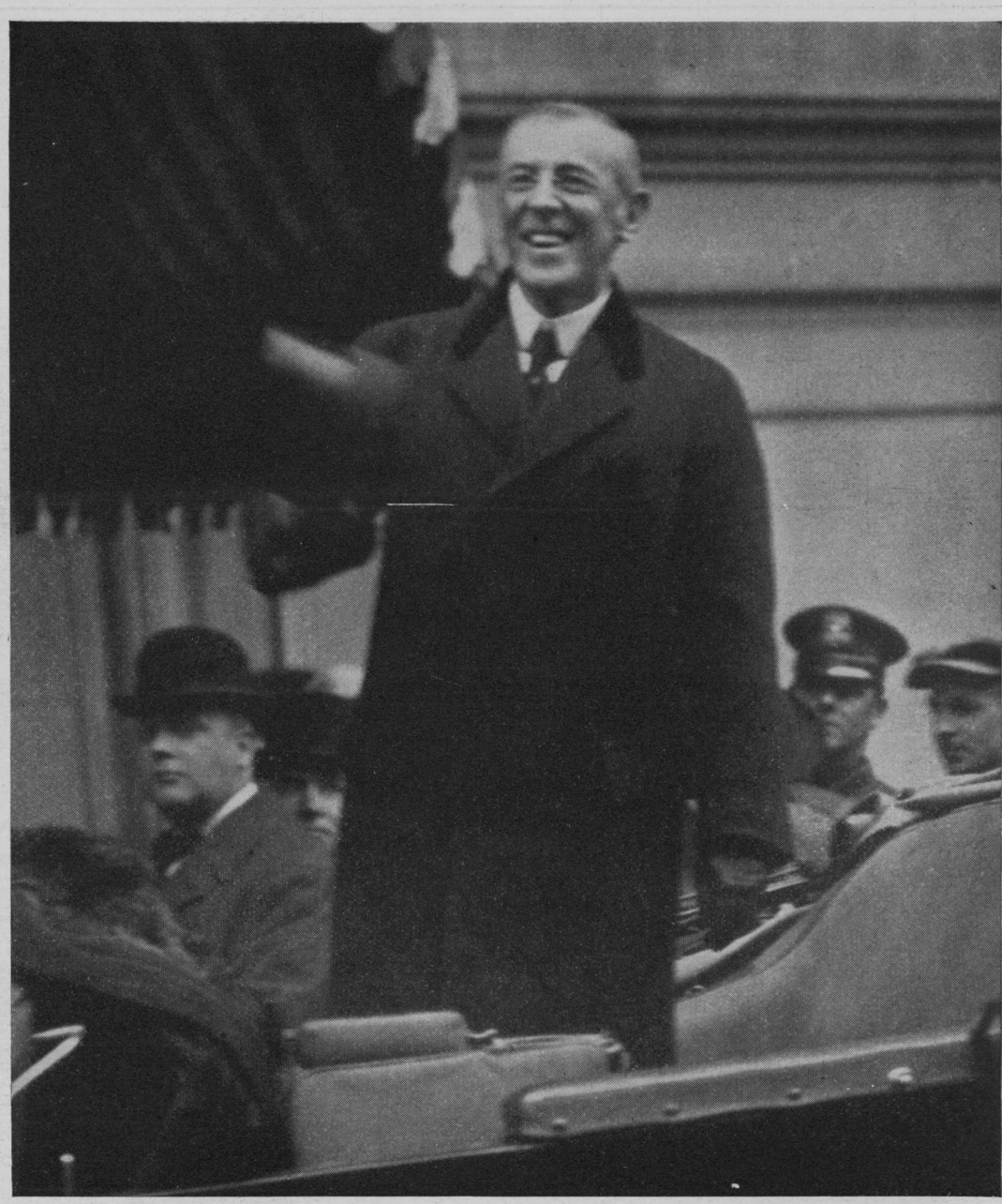
THE PRESIDENT STANDING UP IN HIS*AUTOMOBILE IN RESPONSE TO THE PROLONGED CHEERING