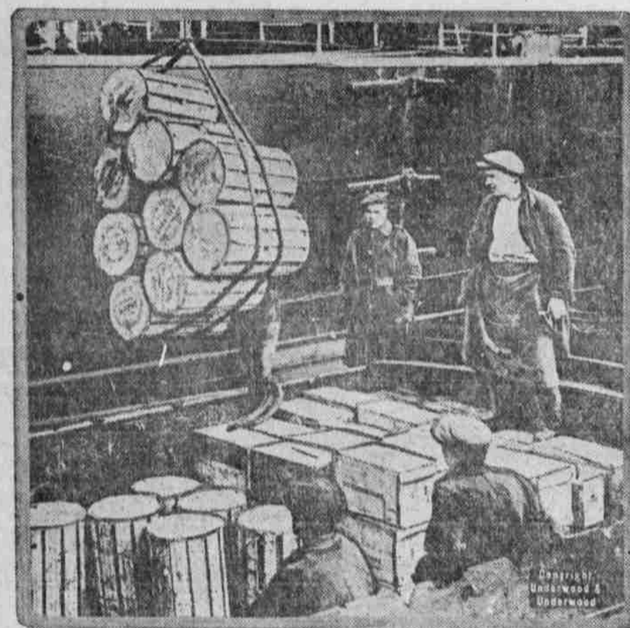
A British ship discharging food at Rotterdam into German boats for the German civilian population. The industrial centers where strikes are prevalent will get no relief until order is restored.