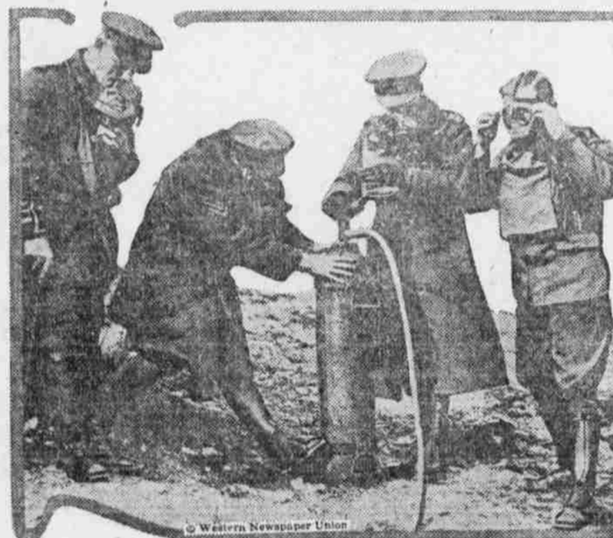
Poison gas is now being put to a good use in England. The gas is injected into rat holes by means of a rubber tube. Most of the rats are killed underground, but any which come out are dazed and easily struck down.