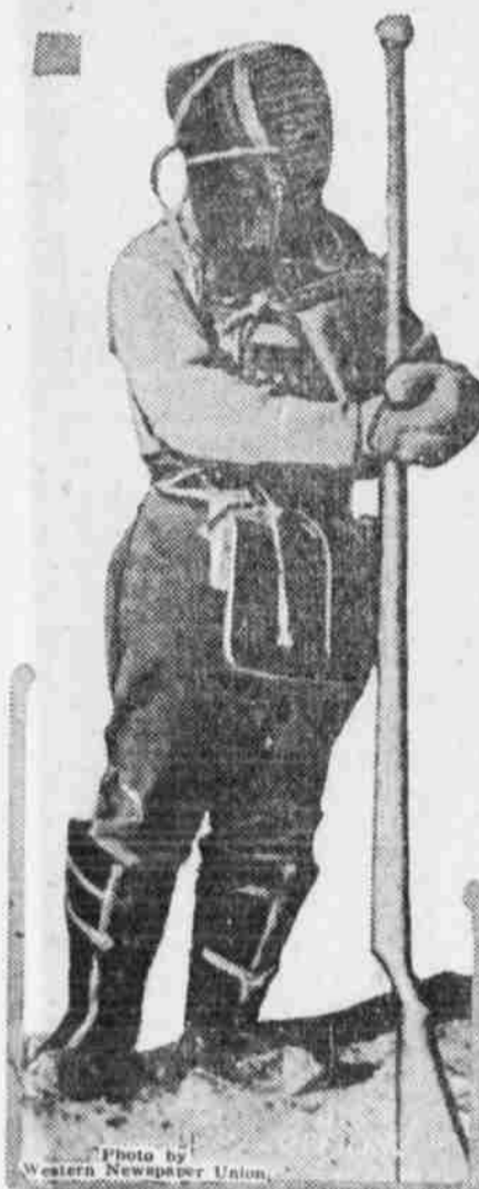
Costumes used by the Japanese army to teach the soldiers the art of fencing and bayoneting. These costumes permit them to use as much force as they would in actual combat. The photograph was taken in Siberia.