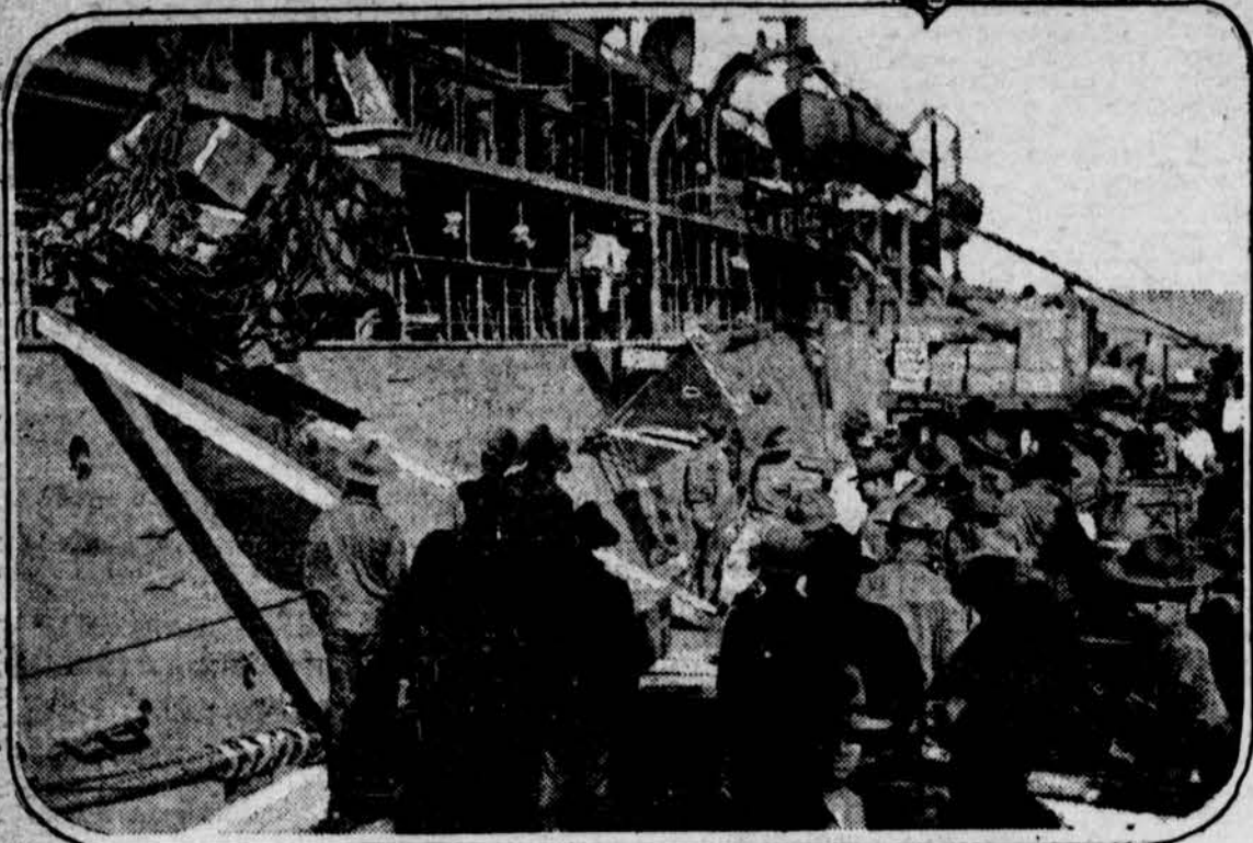
HOISTING MARINES' "KIT" ONTO TRANSPORT HANCOCK AT NEW ORLEANS.