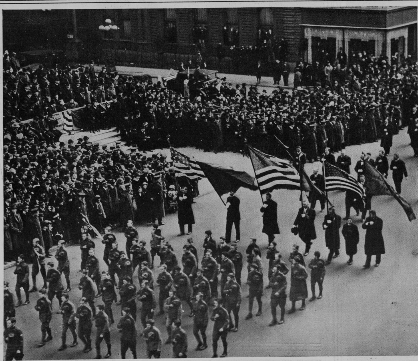
ST. PATRICK'S DAY PARADE PASSING THE MAYOR, CARDINAL FARLEY, AND THE REVIEWING PARTY IN FRONT OF ST. PATRICK'S CATHEDRAL.