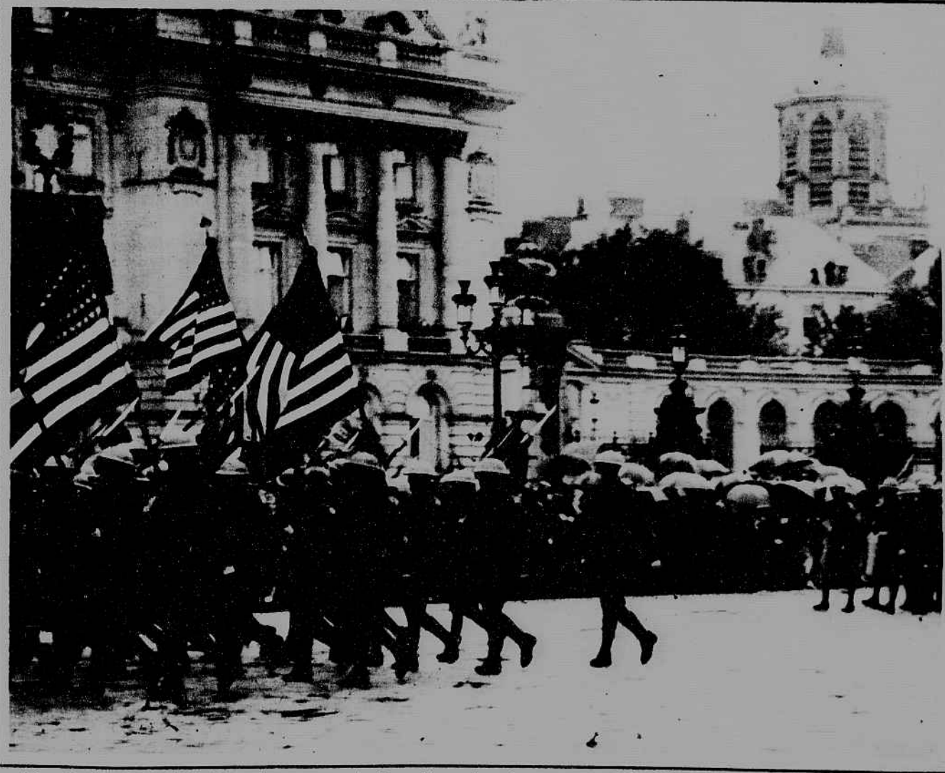
After Paris and London. Brussels came next in line with a triumphant peace parade. Here are our Yanks again leading the procession, this time past the Belgian capital's royal palace. Old Glory gaily waving despite the drizzle that fell throughout the whole celebration.

Shank's mare with a one-man umbrella top was of necessity the transportation choice of most New Yorkers last Monday. The "L" and "Sub" tieup resulted in the worst traffic congestion the city has ever known. Here's a cross section of it—at Fifth Avenue and Forty-second Street.