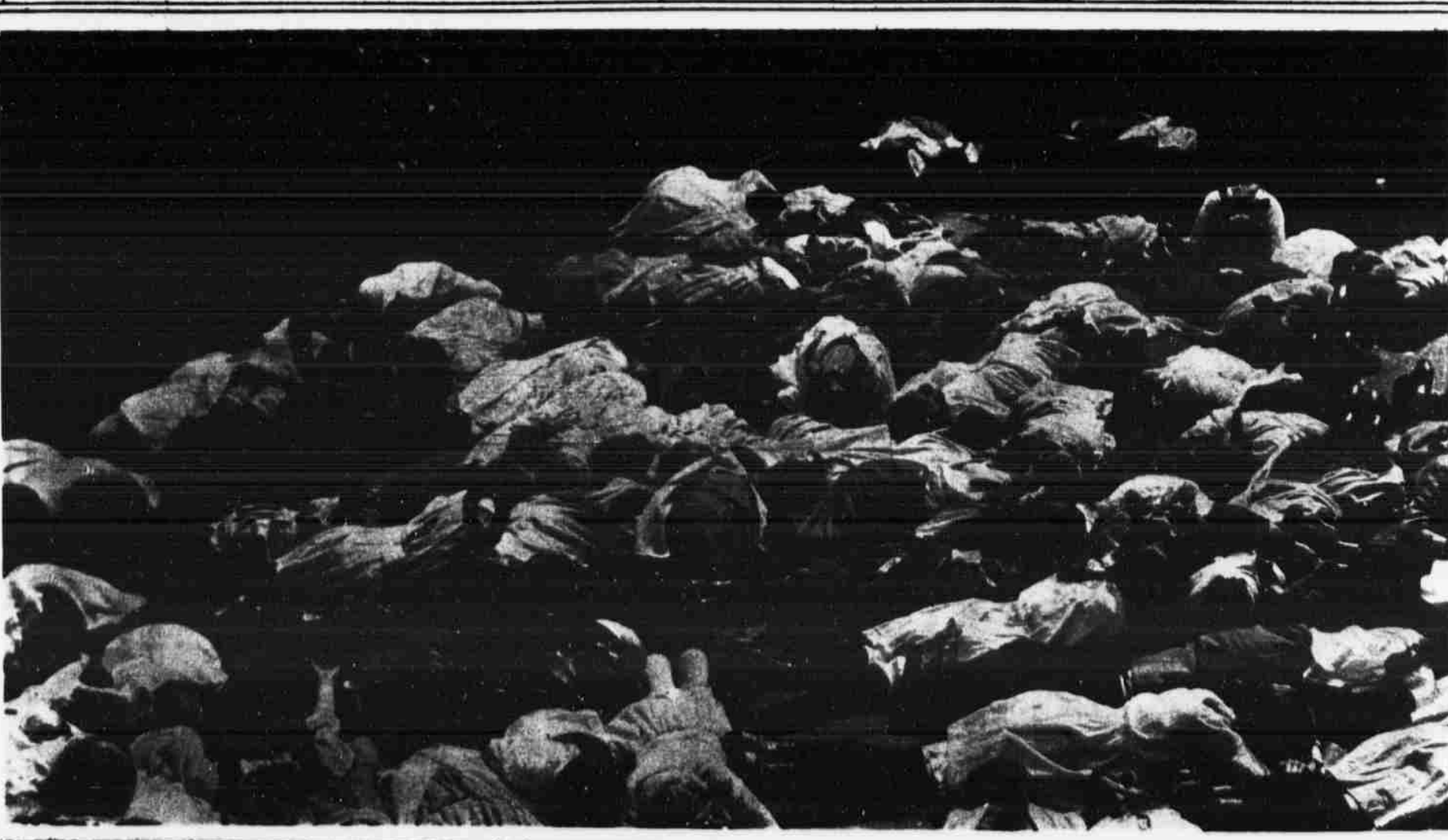
Not victims of the Huns' air raids on Britain, merely preparing to prevent being slain by bombs. Schoolgiris in Sussex at a raid rehearsal obeying the command: "At the given signal lie down anywhere." These drills are expected to reduce youthful death losses in the future.