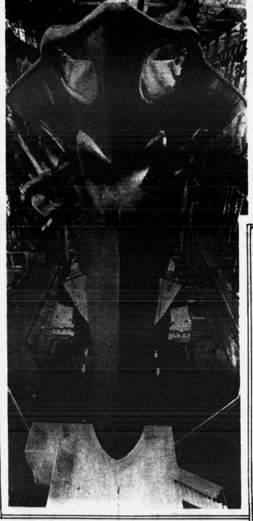
Like some prehistoric monster loomed the Idaho, latest of American dreadnoughts to be launched, as she rested on the ways at Camden, N. J., on June 30. This greatest of fighting machines, for secrecy, was built under a covered shed and few saw it take the water, precautions due to the war. The bows on view shows the platform ready for the launching party. The Idaho's sponsors used both wine and water in naming her.