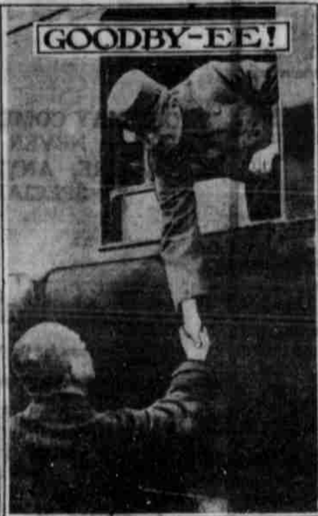
It took ex-emperor Carl of Austria-Hungary only a few short days to learn that his former subjects were not clamoring for a king—especially a Hapsburg—as he thought. At 87, Carl is shown on his arrival at Steinhilber, Hungary, "to become king." Right, bidding farewell to friends who Hungary ordered "back to exile."