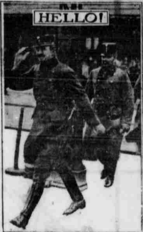
First Picture of Ex-King Charles' Return to Exile