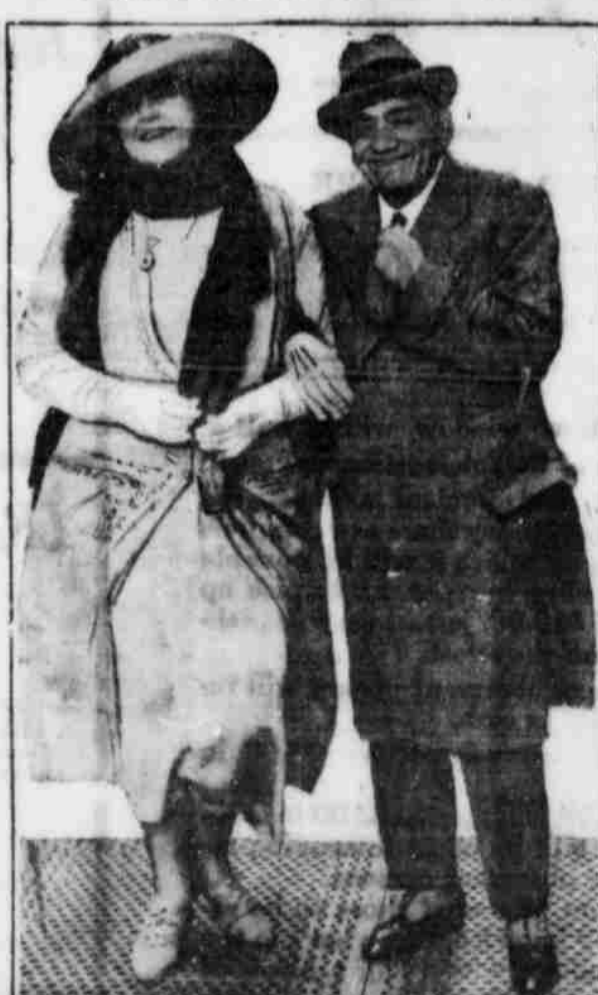
Enrico Caruso's recent illness left him thin and weak, but the noted tenor smiles the same old Caruso smile. He is able to be out now for a brief daily automobile ride in New York. This picture shows him entering his apartment with Mrs. Caruso after a ride.