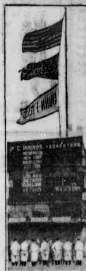
"American League Championship, 1920," is the inscription on the pennant that was raised at Denon Field, Cleveland, April 20. The Indians' pennant of white with the stars and stripes, the pennant and the Denon field banner went up.