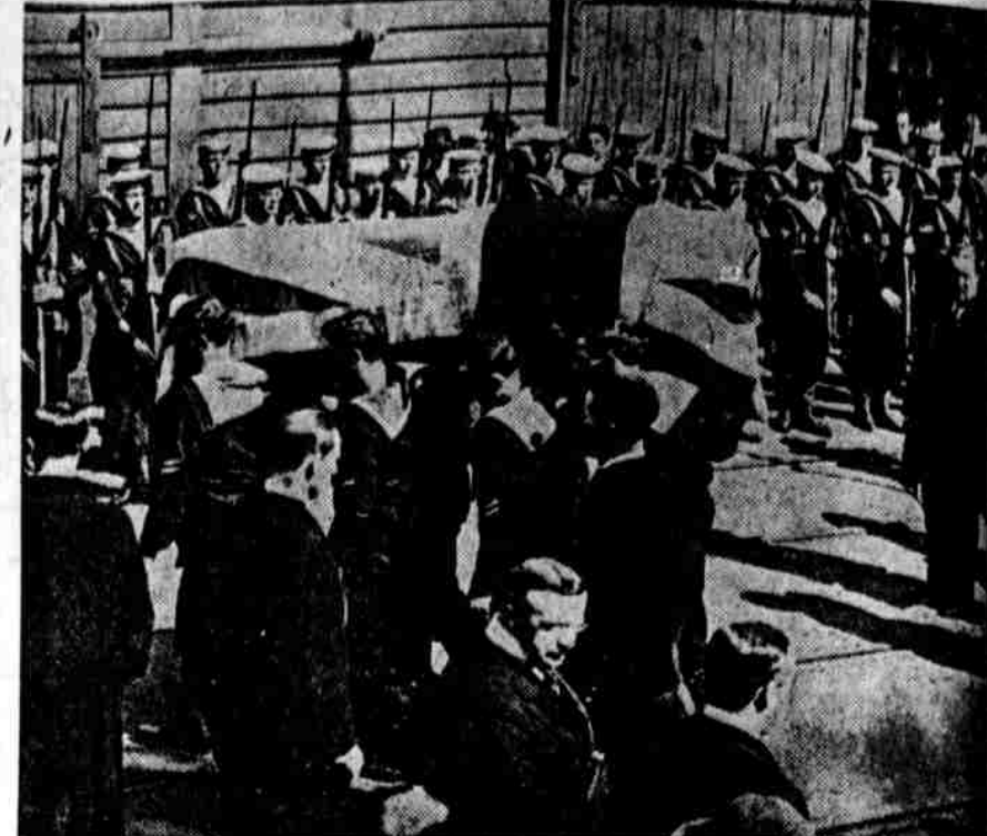
FUNERAL OF EX-EMPRESS EUGENIE. The body of the one-time empress of the French and widow of Napoleon III arriving at Southampton, England from France.