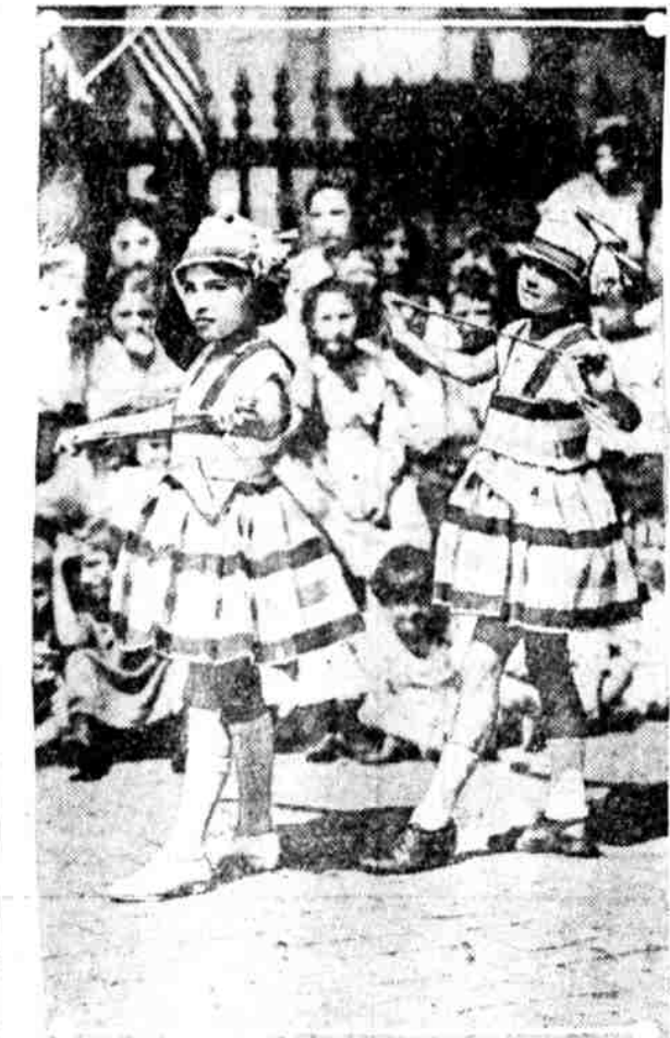
YANKEE DOODLE DANCE. This was a part of the entertainment given yesterday afternoon at the Rush School, Fifth street and Snyder avenue.