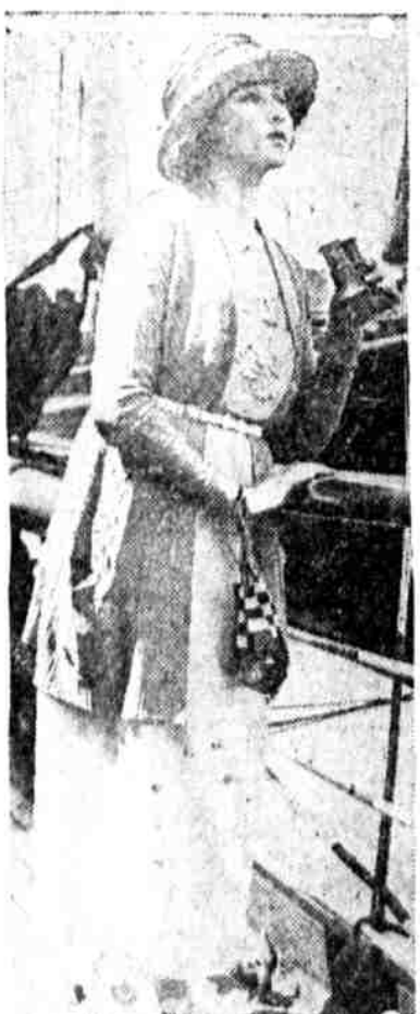
ABOARD SIR THOMAS LIP-TON'S VICTORIA. From this point of vantage Miss Anna Q. Nilsson saw the yacht race on Monday.