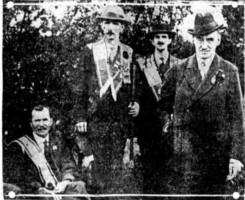
SIR EDWARD CARSON (right) with his Orange bodyguard. They wear the regalia of the Orange Lodge as they accompany Sir Edward in the Belfast region.