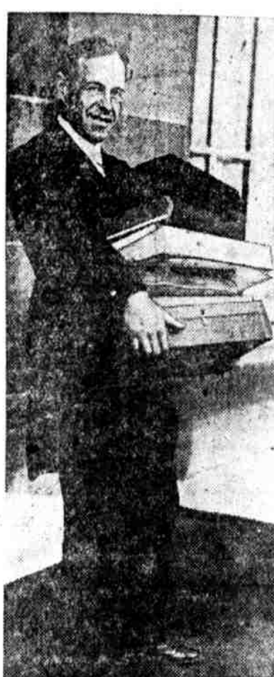
CARRYING THE ALLIED PEACE TREATY WITH AUSTRIA. An under secretary posed at the Palais d'Orsay, Paris.