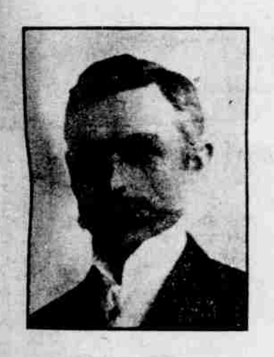
"Cowboy Candidate" for a Supervisor-