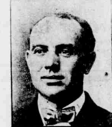
The Country Candidate for the Board. Business Man Candidate for Treasurer.