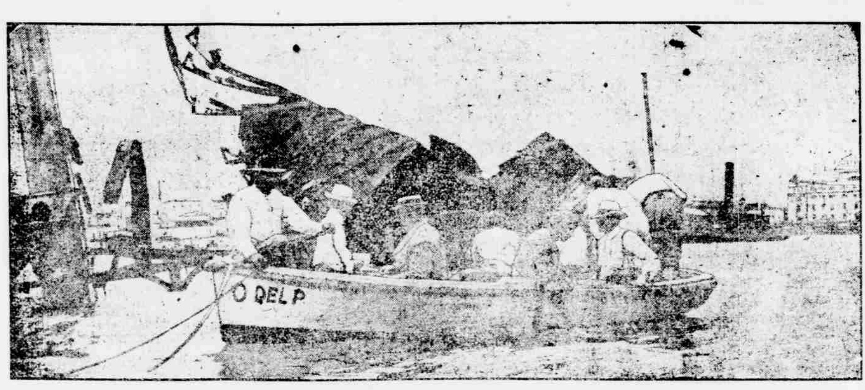
UNITED STATES COMMISSIONERS SUPERINTENDING THE MAKING OF BORINGS AROUND THE WRECK OF THE MAINE IN HAVANA HAR-

orps of Engineers, I wited States well, but I'll lend it to you if you promise not to keep it too long. Gay-Cuban officials are cooperating cor- boy-I'll undertake to spend every pendially with the army engineers and ay of it before tomorrow morning.—