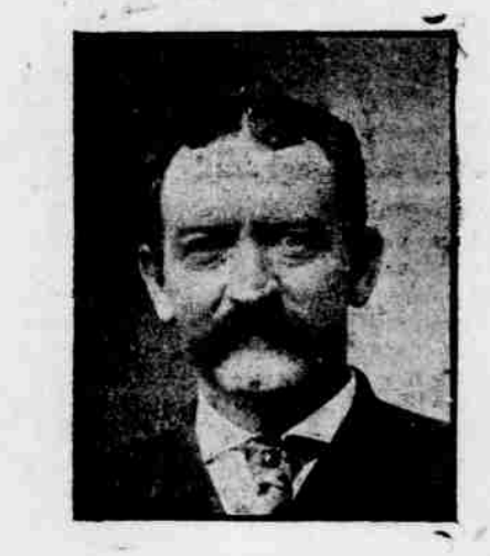
Candidate for another term as Super- Candidate for reelection to the Board of Supervisors.