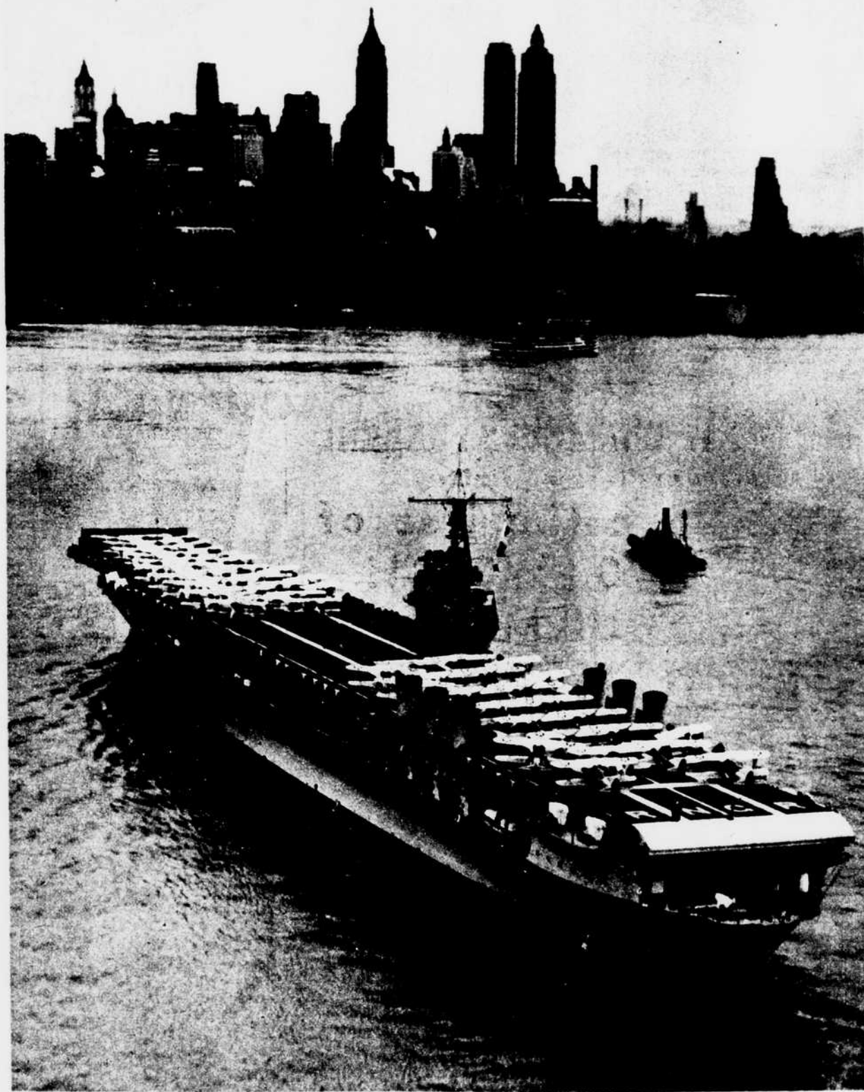
By day, Manhattan's towering skyline looms behind the aircraft carrier Ranger, at anchor in the Hudson for the Fair. The Empire State Building rises at center above the other skyscrapers.