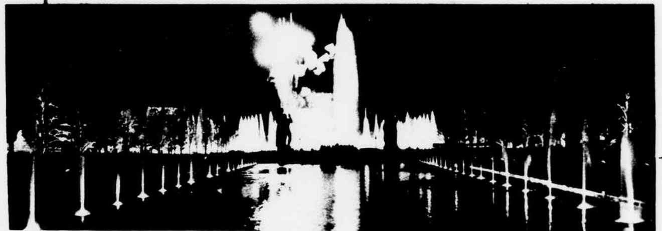
Night made wondrous at the World's Fair Lagoon of Nations. Fireworks add to the dazzling effect of lighted fountains.