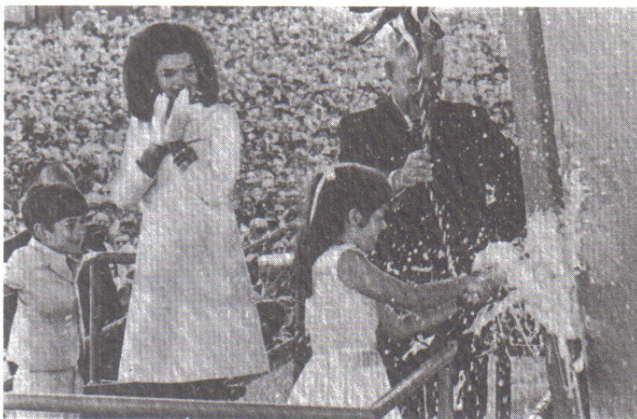
Caroline Kennedy served as sponsor for John F. Kennedy (CV 67) and was just 9 years old when she christened the ship in Newport News.

Ms. Kennedy attended Sotheby's Institute of Art in London, England, from 1975-1976. She earned a B.A. in Fine Arts from Harvard University in 1980. Ms. Kennedy received her J.D. from Columbia University Law School in 1988.