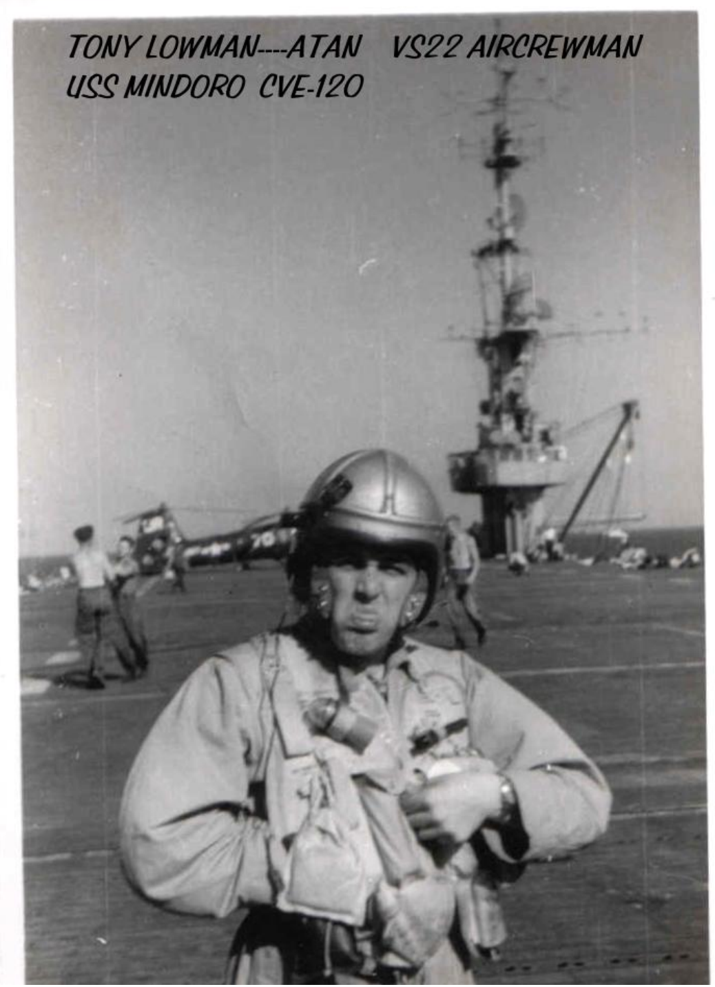
VS-22 AIRCREWMAN---MAKING A BAD FACE PREPARING FOR A PATROL FLIGHT (During the flight, he crashed into the sea alongside the carrier)