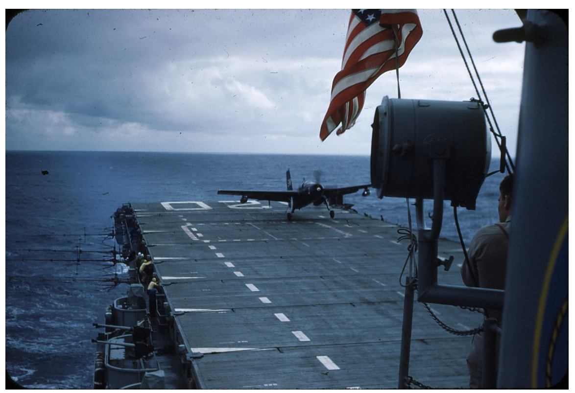
GRUMMAN AF GUARDIAN AIRCRAFT LANDING ON CVE-120 MINDORO