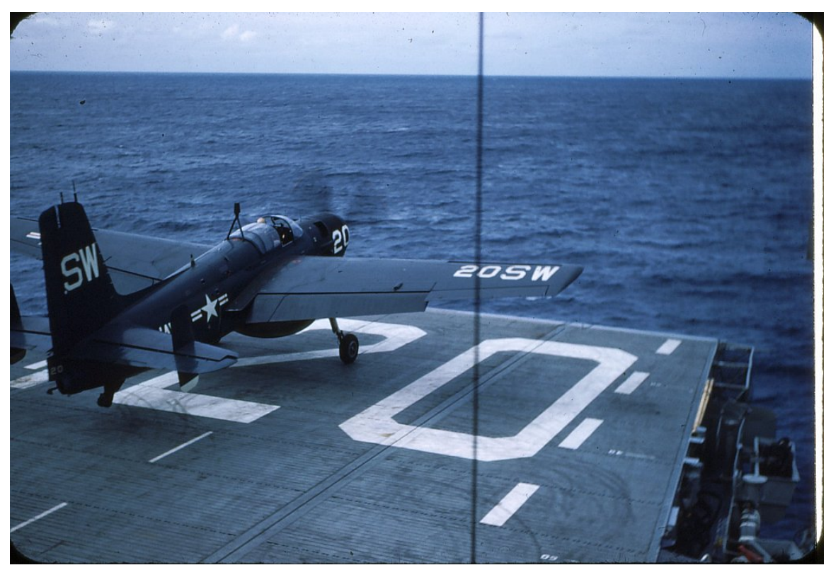
LAUNCH OF AN AF GUARDIAN AIRCRAFT FROM THE CVE-120 MINDORO