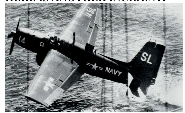
VS-22 AF GUARDIAN---ALMOST CRASHING ALONGSIDE THE SHIP. THE TAIL OF THIS AIRCRAFT SCRAPED THE SEA BUT SOMEHOW IT DID NOT CRASH. WHEW! NOTE THE CREWMAN COCKPIT DOOR IS OPENED, EXPECTING A CRASH.