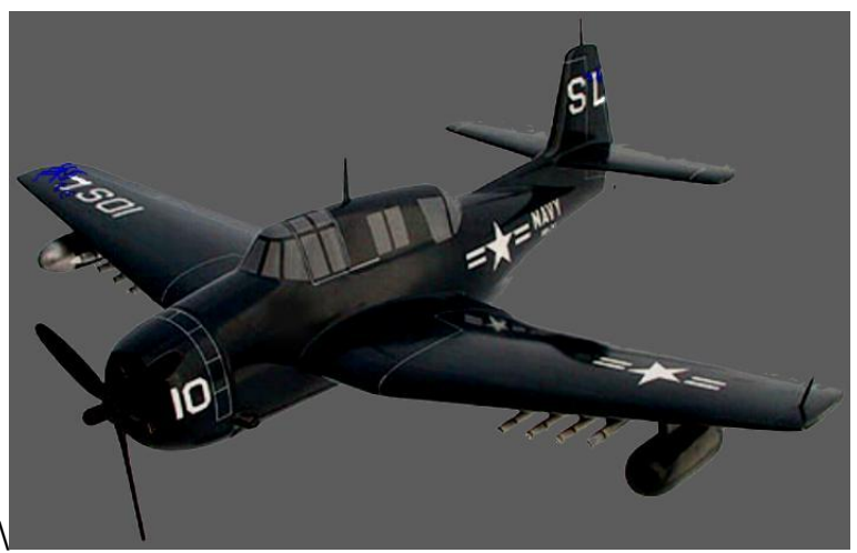
MODEL OF AN ANTI-SUBMARINE GRUMMAN AVENGER AIRCRAFT. ON THE RIGHT WING IS A SEARCHLIGHT. ON THE LEFT WING IS A RADAR POD. THE AIRCRAFT CARRIED A CREW OF 4. I SPENT MANY SCARY NIGHTS IN THIS GREAT AIRPLANE, AND ALSO IN GRUMMAN AF GUARDIANS. See pictures below/