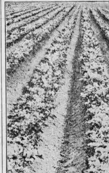
Excellent Crop of Celery.

heavily manured; in fact, it ought to be well fertilized for at least two years before being planted to celery.