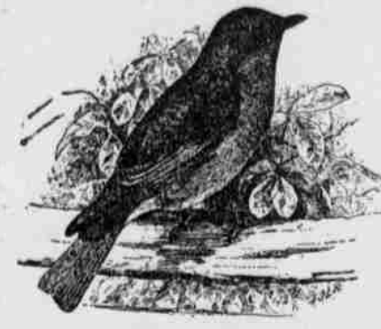
Bluebird-Above Azure Blue, Throat and Breast, Cinnamon, Belly White.

It is evident that in the selection of its food the bluebird is governed more by abundance than by choice. Predaceous beetles are eaten in spring, as they are among the first incaterpillars form an important part of the diet, and these are later replaced