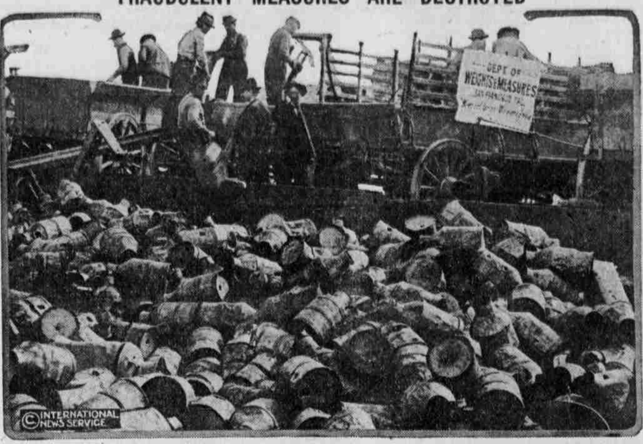
San Francisco had a clean-up of fraudulent weights and measures recently and vast quantities of them were lestroyed. The picture shows 8,000 milk cans being dumped into barges to be towed out to sea and given a watery