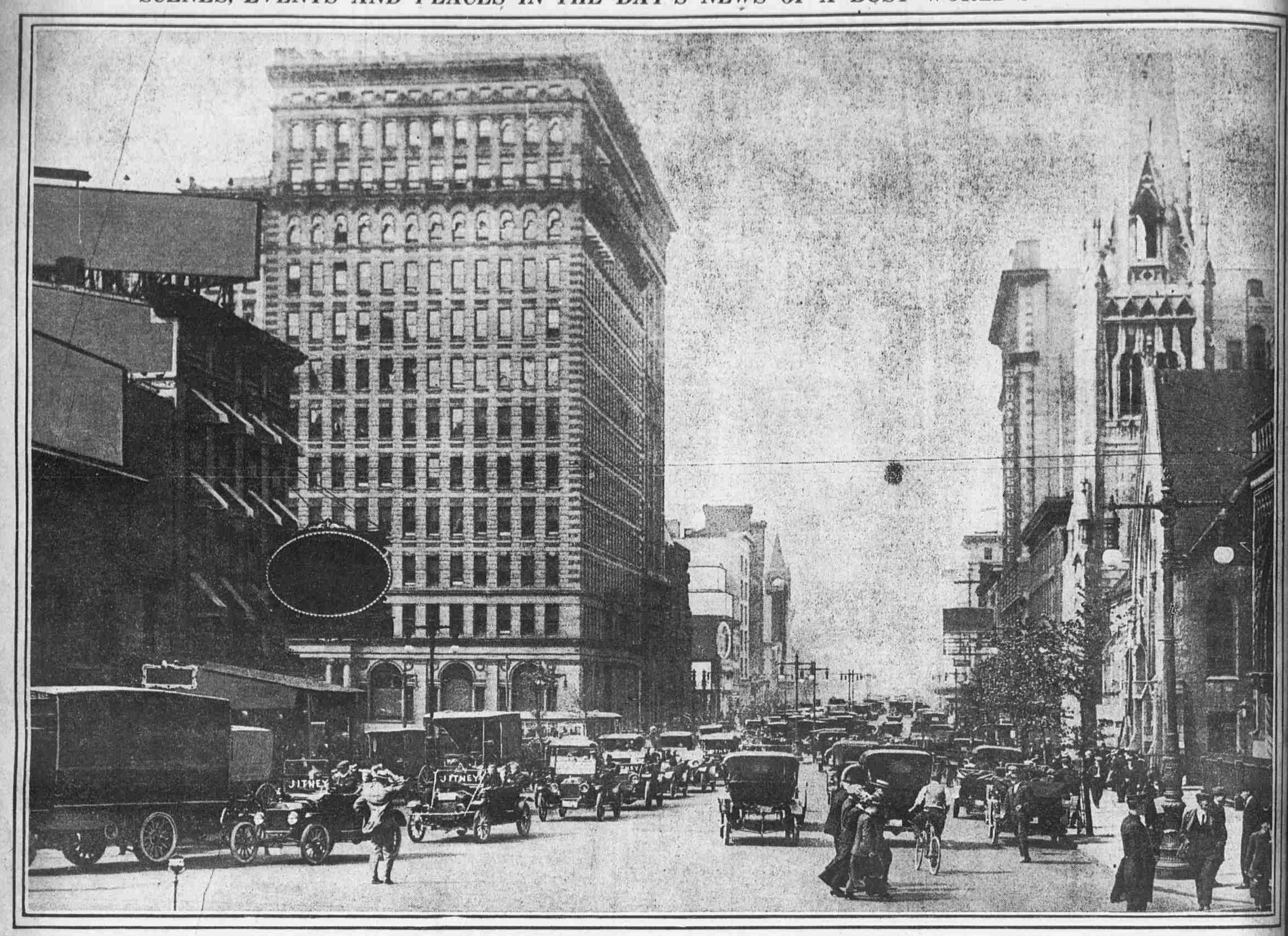
NORTH BROAD STREET TRANSFORMED IN A MONTH BY THE OMNIPRESENT JITNEY BUS This picture was taken at an uncongested hour from the north plaza of City Hall, and shows the swarms of jitneys that crowd the thoroughfare. It will be seen that the jitney is omnipresent, even at hours of normal traffic, and that it lords it over the private car by force of superior numbers. For hours at a time the jitneys maintain a ratio of three to one to other cars. The outlying sections of North and South Broad street are now as busy as the central district used to be before the advent of the triumphant "jit."

SCENES, EVENTS AND PLACES IN THE DAY'S NEWS OF A BUSY WORLD'S ACTIVITIES