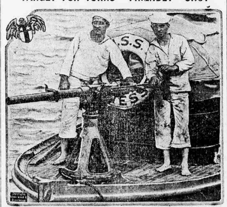
This is the launch of the U. S. S. Tennessee at which a Turkish fort in the harbor of Smyrna fired a shot, which afterward was declared to be only a "friendly" warning that the harbor was mined and closed to alien vessels.