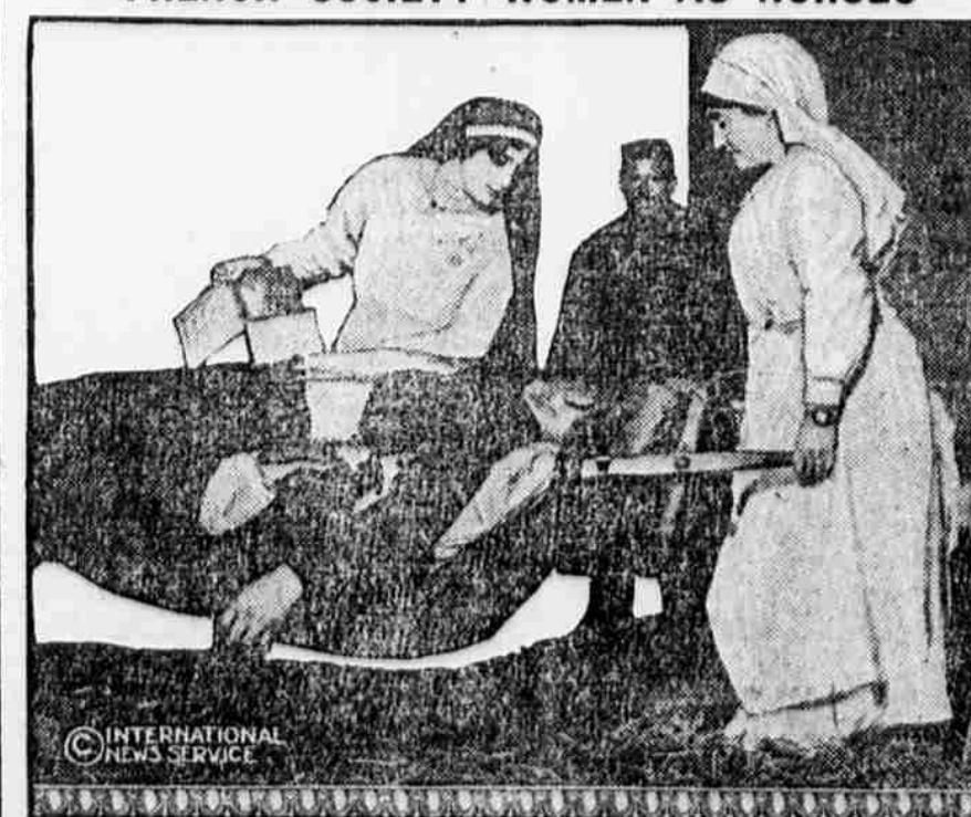
Parisian women, well known in society, attending wounded soldiers at the Gare du Nord as they arrive from the battlefields.