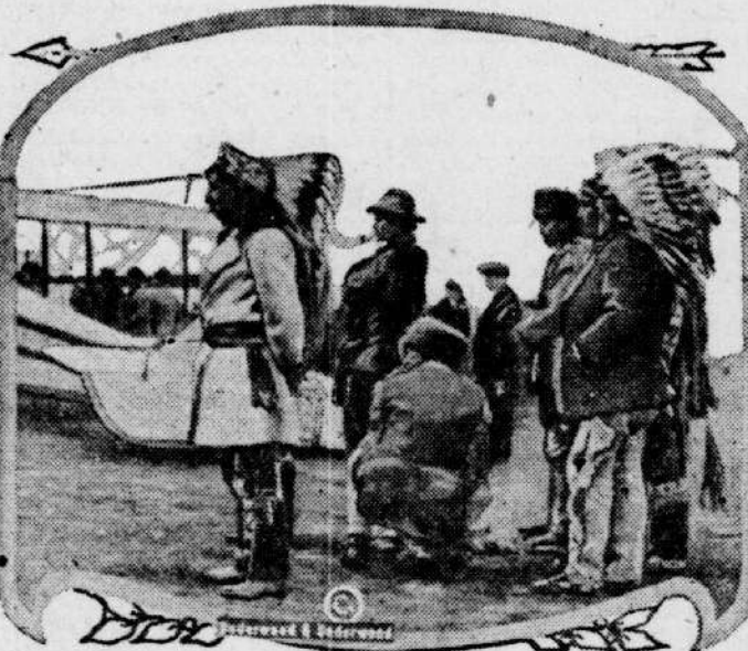
These Indians at the 300th anniversary of the Hudson Bay company at Fort Garry, near Winnipeg, Canada, are seeing an airplane for the first time. The Indians are from Canada's Great Northwest. The plane brought mail to Fort Garry from the United States.