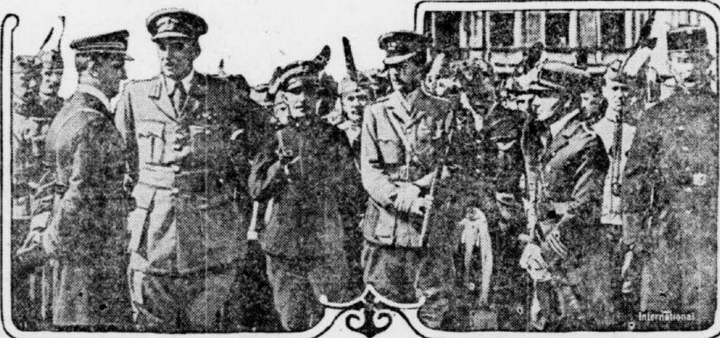
Admiral Von Horthy, the regent of Hungary, discussing the peace situation with the emissaries of the entente mission in Debrecen. The admiral is seen on the extreme left of the photograph in the foreground.