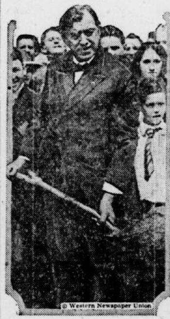
Dr. Russell H. Conwell, famous lecturer, preacher and founder of Temple University, Philadelphia, breaking ground for an extension to the university. All of his earnings from lecturing and preaching, about $4,000,000, have been given by him for aiding the education of young men and women.