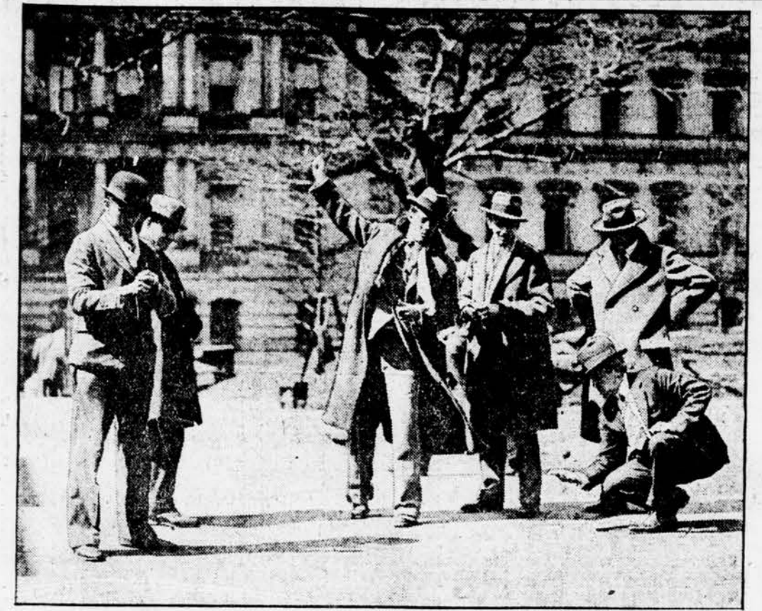
WHAT'S THE MATTER WITH THE YOUNG MAN OF TODAY? Heretofore, a greater part of the discussion has concerned the flapper, but the male probably needs as much attention. These boys, members of the Atlantic City High School team which recently won the interschelastic swimming championship, visited the White House yesterday. And while waiting to see the President spent their time spinning tops on the pavement! The boys claim the fad has been taken up by students at Yale.