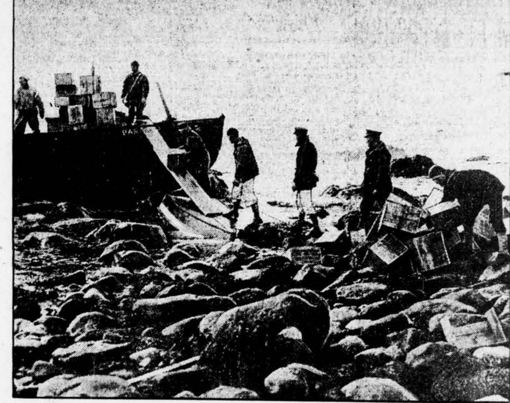
AGROUND IN THE FOG, VESSEL GIVES UP $30,000 WORTH OF LIQUOR. The good ship Barbara wer ashore last Friday at Fishers Island, New York Harbor. The Coast Guard men investigated and discovered 600 cases of liquor aboard. They confiscated the illicit cargo, and the photograph was taken while the cases were being unloaded.