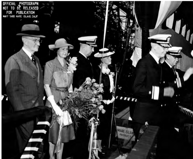
Official Launching Party: