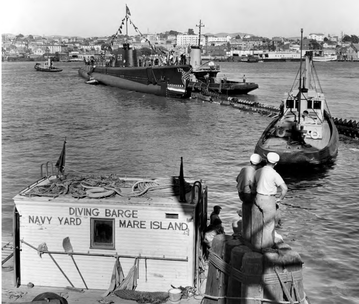
Four Mare Island built vessels working together to move USS Silversides to her berth after her launching. Left to right are: Tug YMT 2 (1918), USS Silversides (SS 236) with the tug Wahnetta (YT 13) (1939) and YMT 10 (1919).

OFFICIAL PHOTOGRAPH NOT TO BE RELEASED FOR PUBLICATION NAVY YARD MARE ISLAND, CALIF