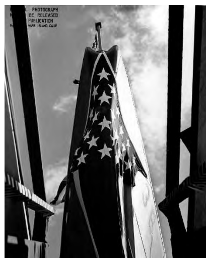
Bow of USS Silversides (SS 236) on the building ways prior to her launching.