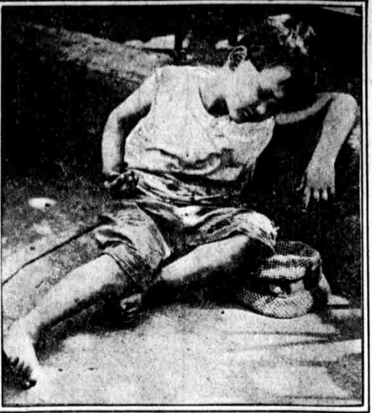
CONQUERED BY HEAT. He was sleeping, with head against cirbstone that runs around Starr Garden, Sixth and Lombard streets, when the photographer came along