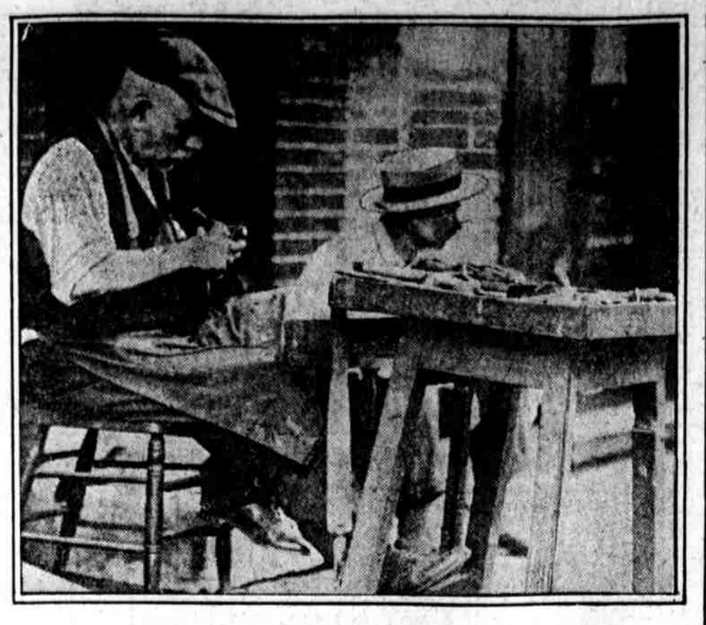
HEAT "EVICTED" HIM. A cobbler on Carpenter street near Eighth was forced to move his workroom to the sidewalk, where shade and a slight breeze helped to make work casier