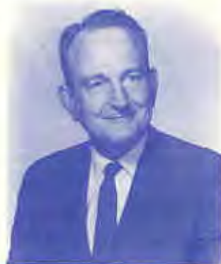
THE HONORABLE GEORGE W. GRIDER Representative from Tennessee

The Honorable George W. Grider, Representative from the 9th District of Tennessee is a native of Memphis. He entered the United States Naval