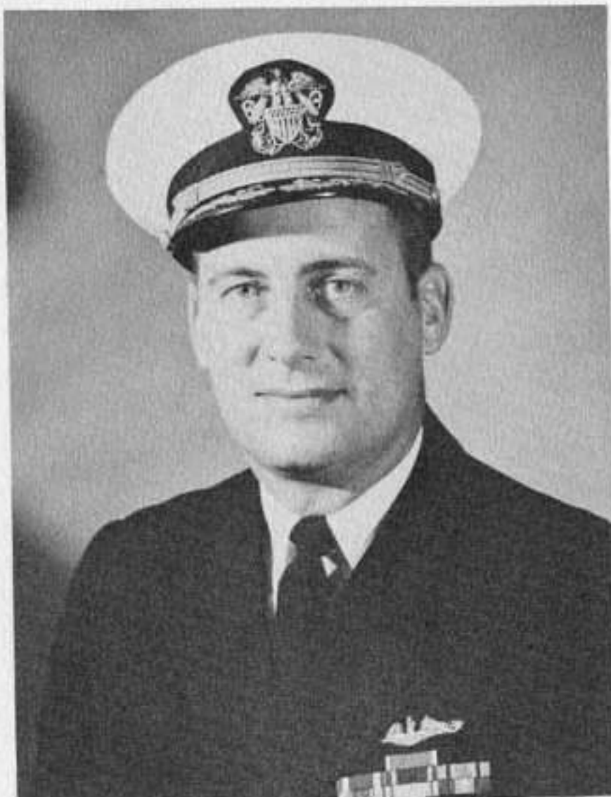
Commanding Officer (Blue)