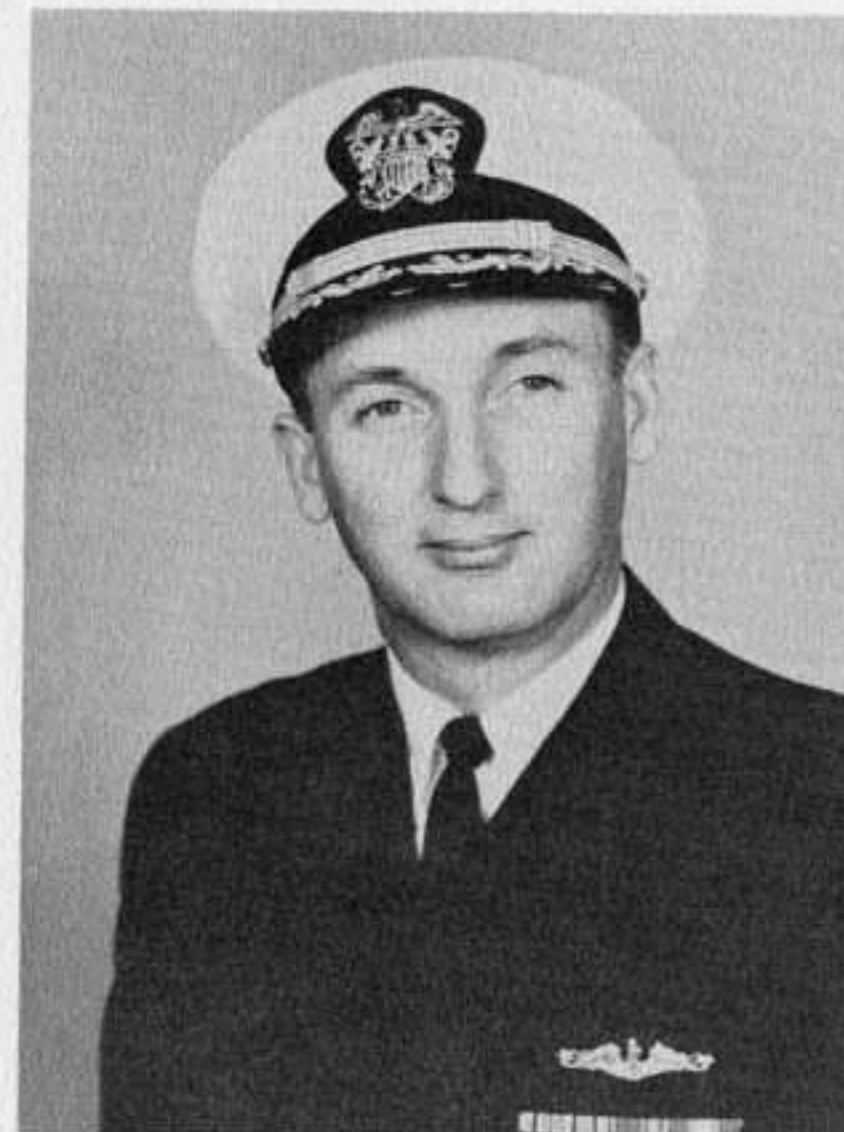
Commanding Officer (Gold)