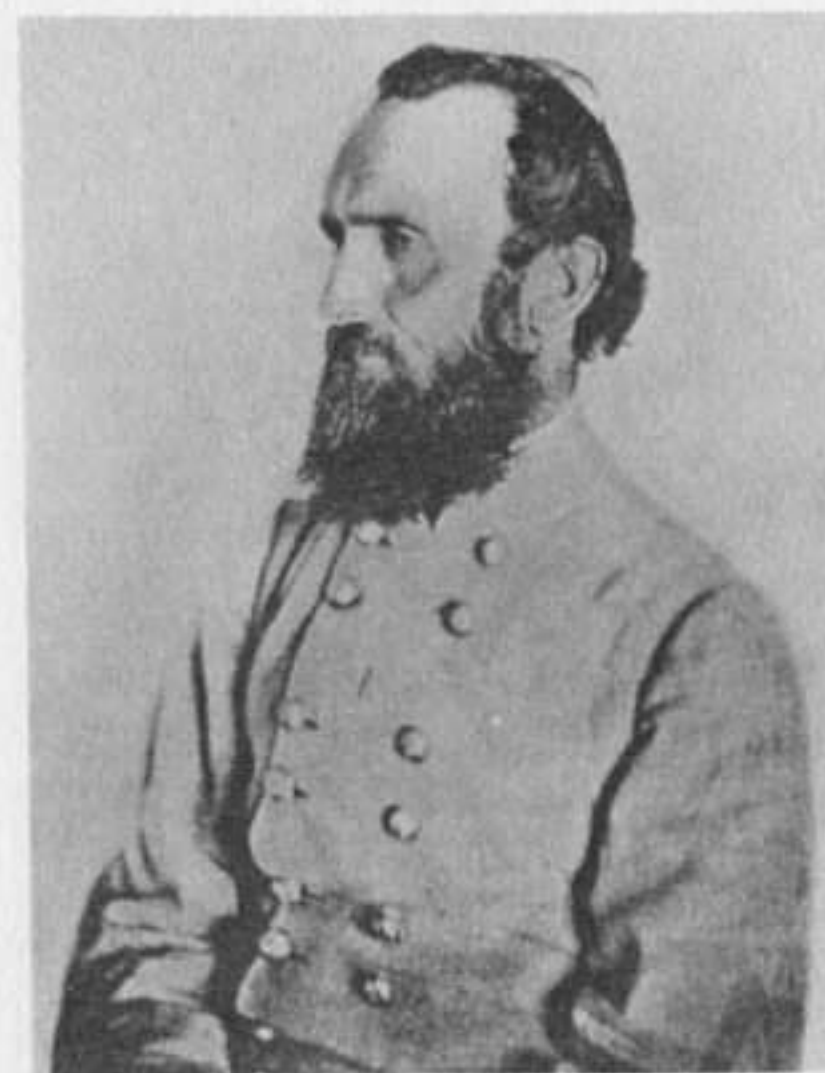
Lieutenant General T. J. Jackson

The design reproduced on the cover of this pamphlet is the ship's insignia. White lettering and stars on a blue and red background are intended to suggest the stars and bars of the confederacy — the cause Stonewall Jackson served so well. The words "Strength — Mobility" emblazoned on the banner are taken from letters written by General Jackson, and apply to the Polaris submarine as well as to the tactics he used so successfully. The American Bald Eagle suggests the strength inherent in the Polaris system, while the arm clothed in a confederate sleeve, thrusting a Polaris missile out of the depths of the Pacific Ocean, suggests the power and concealment of the FBM submarine along with the strength of our heritage from General Jackson.