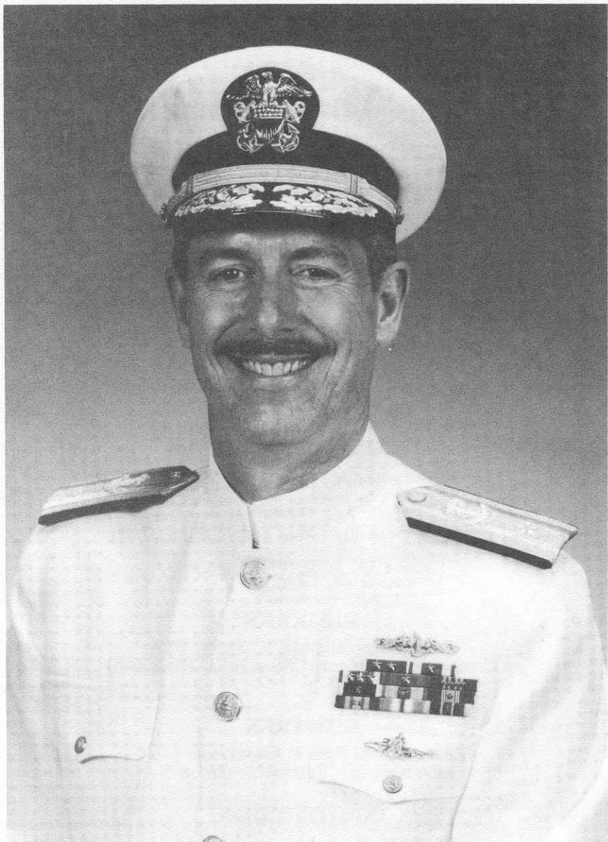
REAR ADMIRAL FRED P. GUSTAVSON UNITED STATES NAVY