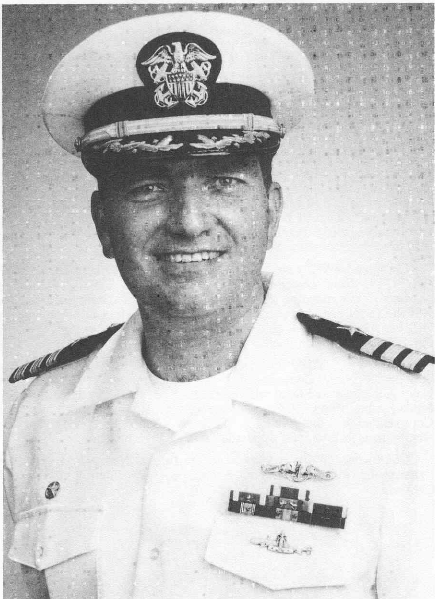
COMMANDER MITCHELL K. SAULS UNITED STATES NAVY