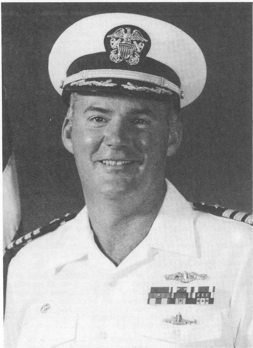
CAPTAIN DONALD P. MILLER UNITED STATES NAVY